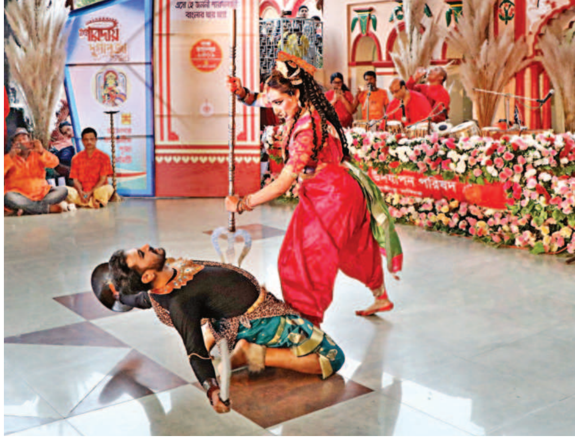
Dancers perform a piece on Goddess Durga's victory over demon king Mahishasura on the occasion of Mahalaya at the Dhakeshwari temple in the capital yesterday. Mahalaya marks the beginning of Durga Puja – the largest religious festival for the Hindu community. The day commemorates the mythical moment when Durga had descended on Earth to vanquish Mahishasura, symbolising the triumph of good over evil.