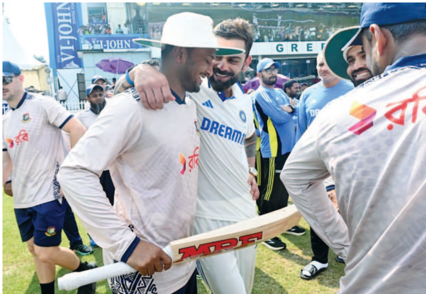
India's star batter Virat Kohli gifted one of his signed bats to Bangladesh all-rounder Shakib Al Hasan after the Men in Blue cruised to a seven-wicket win in the second Test at the Green Park stadium in Kanpur yesterday, wrapping up the series 2-0.