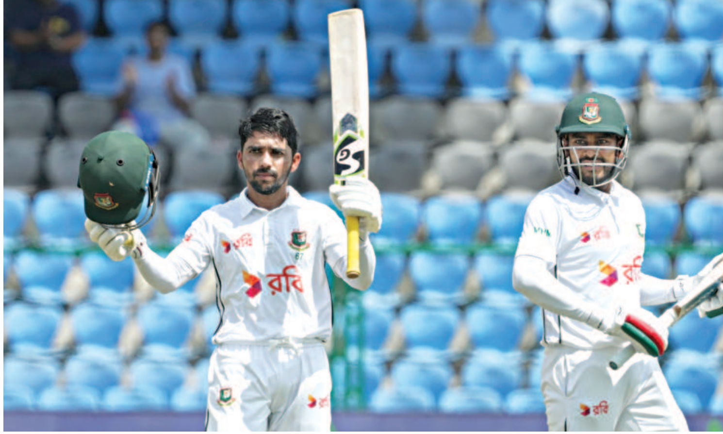
Bangladesh batter Mominul Haque celebrates scoring his maiden Test century against India -- his 13th overall -- on the fourth day of the second Test at Green Park Stadium in Kanpur yesterday, helping the visitors reach a somewhat respectable 233 in their first innings before the hosts declared on 285 for nine. After registering 107 off 194 balls, the former Test captain also took the responsibility to see out the day as the Tigers ended on 26 for two.