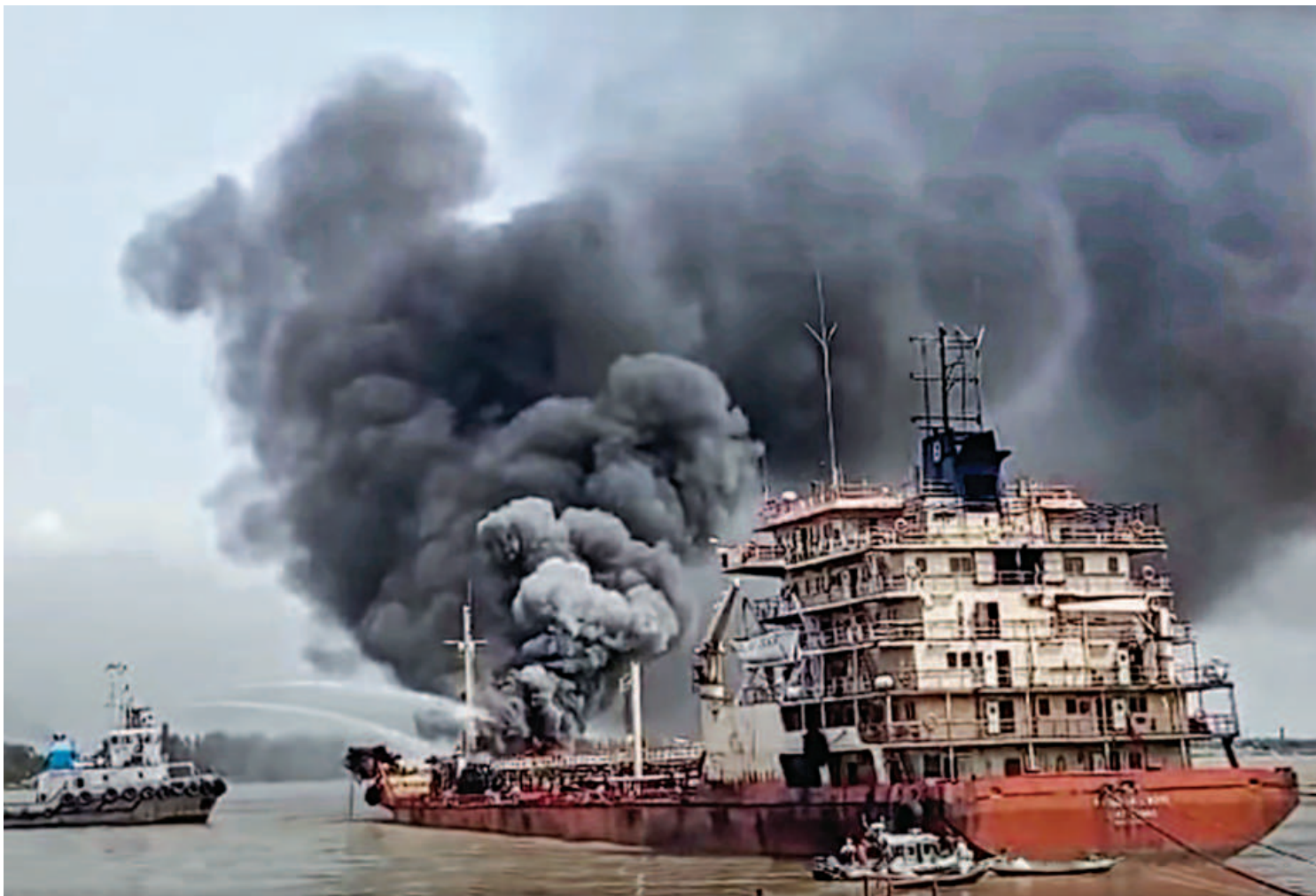
Fireboats working to douse the blaze that resulted from an explosion at the front part of the "Banglar Jyoti," a lighterage vessel owned by the national flag carrier Bangladesh Shipping Corporation, while it was unloading crude oil at Chattogram port around 11:00am yesterday.