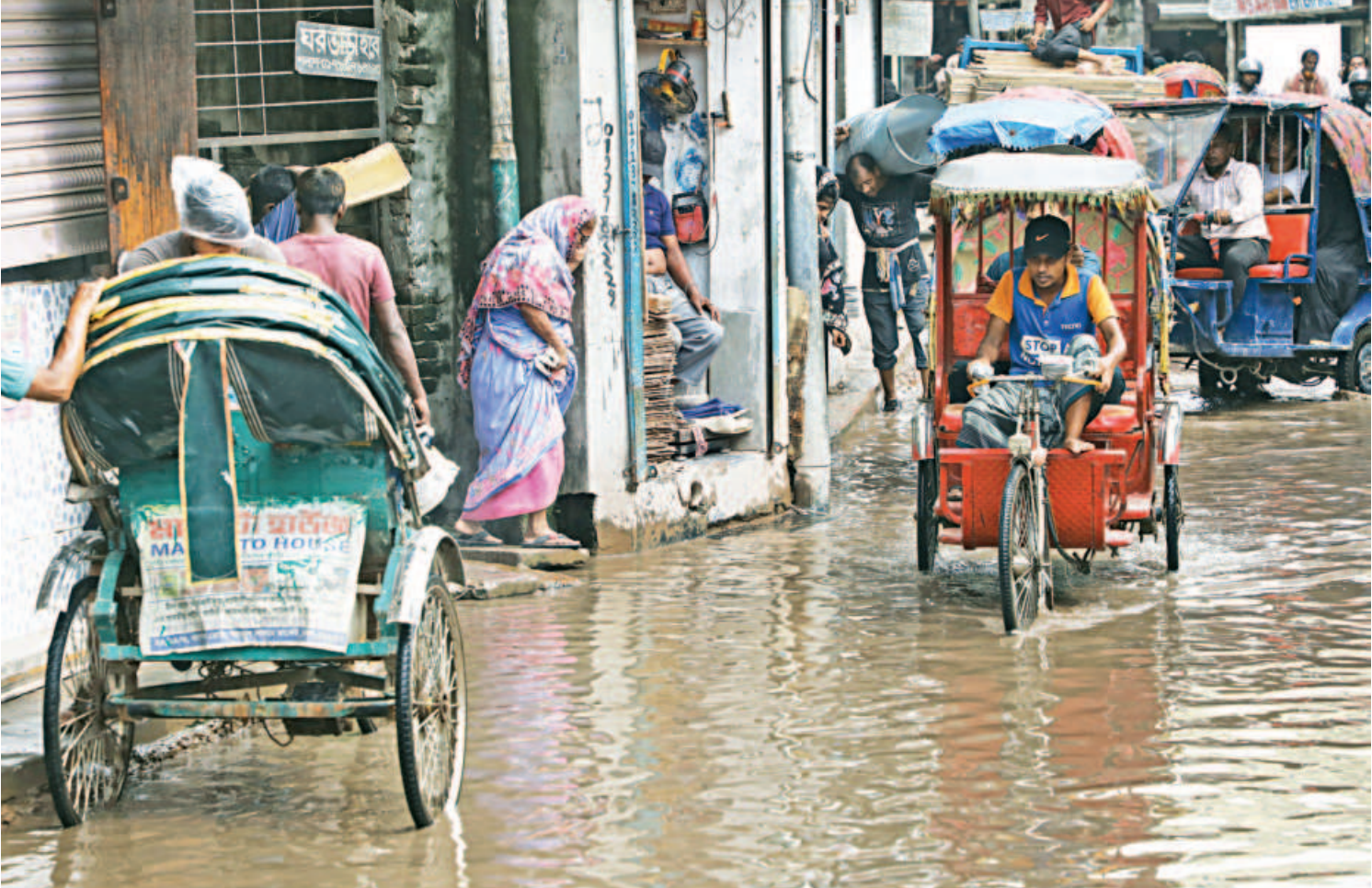
Vehicles navigate through an alley submerged in muddy water from nearby sewers due to a poor drainage system, causing severe inconvenience to passengers and pedestrians. This issue persists almost year-round, with no measures being taken to resolve it. The photo was taken yesterday at Mir Hazirbagh in Dhaka.