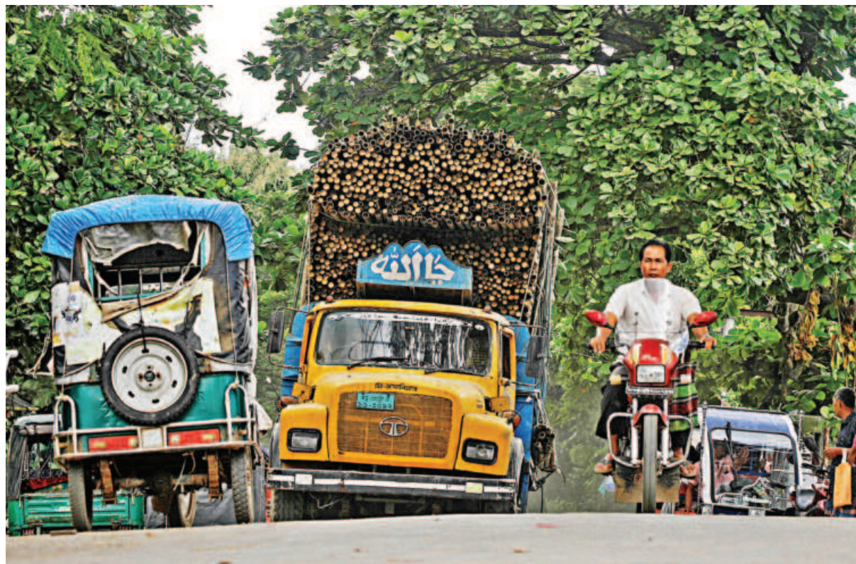
Despite the obvious safety hazards, overloaded trucks on hilly roads is common in Dighinala of Khagrachhari. Such disregard for safety often leads to vehicles tipping to one side and tragedies. The photo was taken from the upazila's Larma Square bazar yesterday.