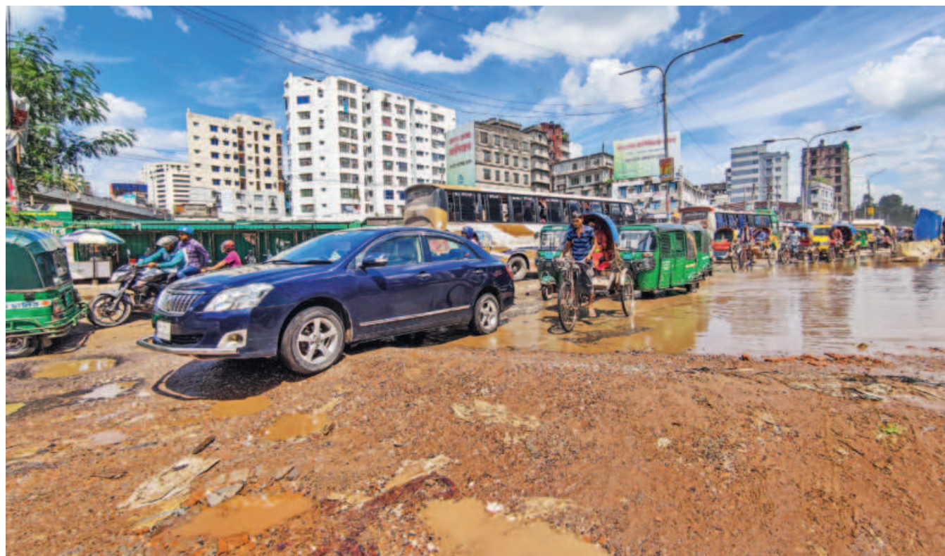
Vehicles having trouble on Atis Dipankar Road in Malibagh. The road, which was already in bad shape, has now become almost impassable due to further damage caused after heavy rains.

"While it may not be possible for them to implement all changes, it would also be unreasonable for them to shoulder responsibilities they cannot carry."