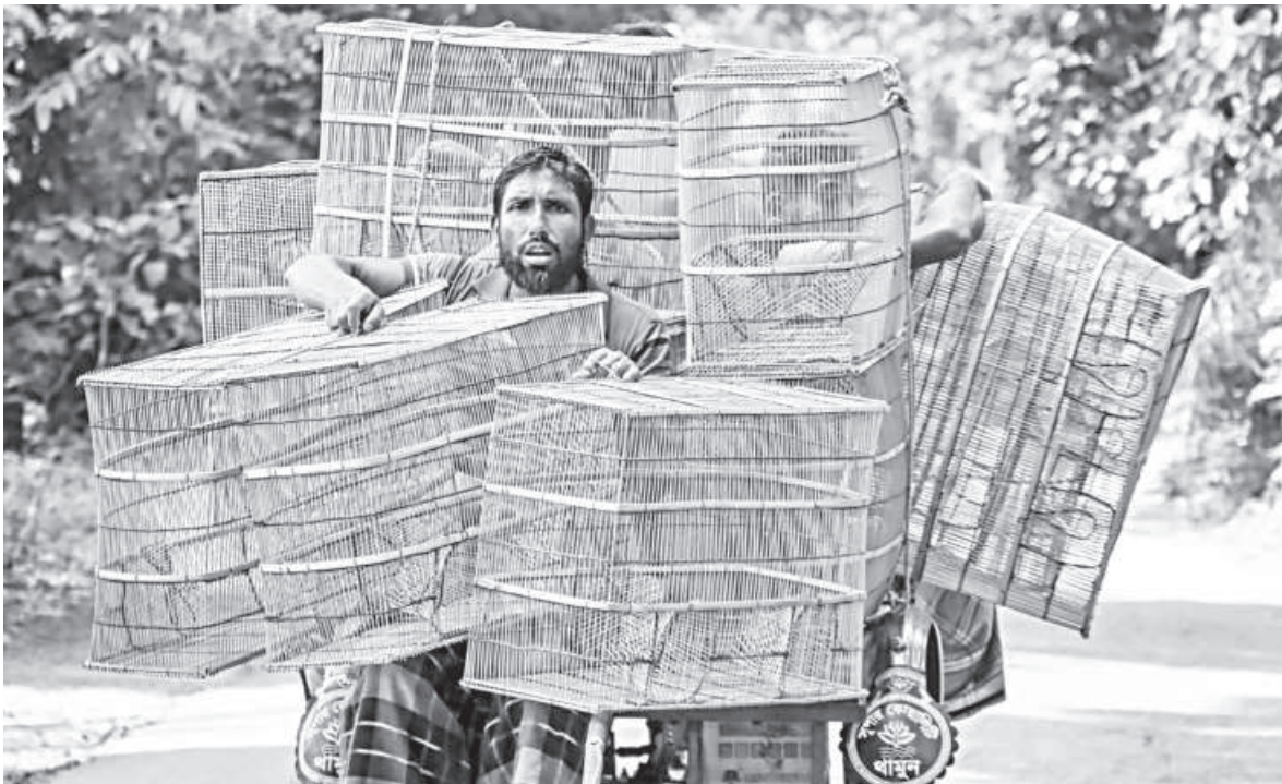
Locals carry fishing traps home after purchasing them from a market in Khulna. These traps are typically placed in water when canals overflow during the monsoon season, catching various native fish such as puti, bele, and taki. The demand for such traps rises during the rainy season, with prices ranging from Tk 800 to Tk 1,200 depending on size and quality. This photo was taken at Phultala upazila recently.