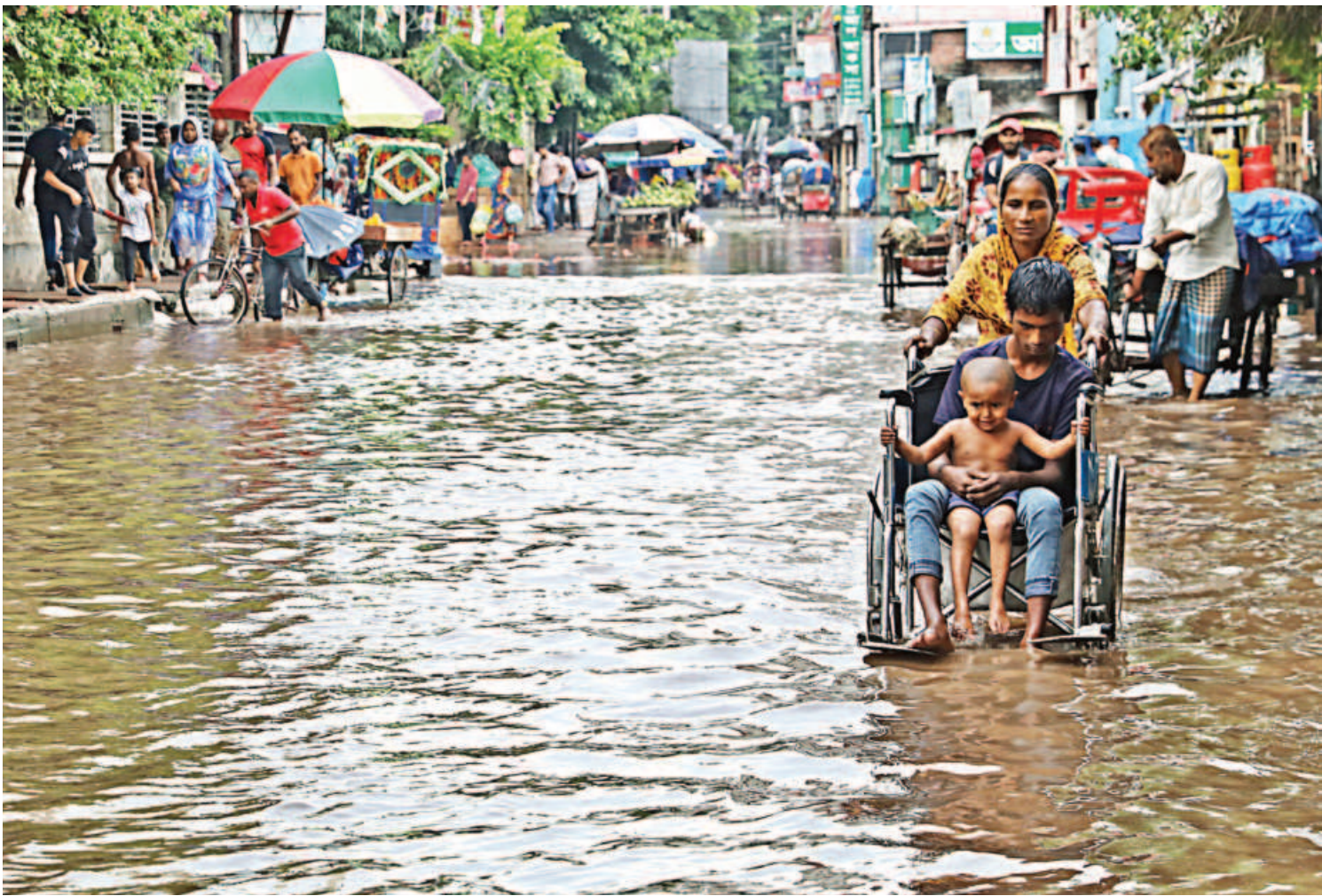
Assisted by a woman, a specially abled child in a wheelchair makes his way along the waterlogged Mugda hospital road in the capital yesterday. According to locals, this road often gets flooded after moderate rain due to poor drainage.