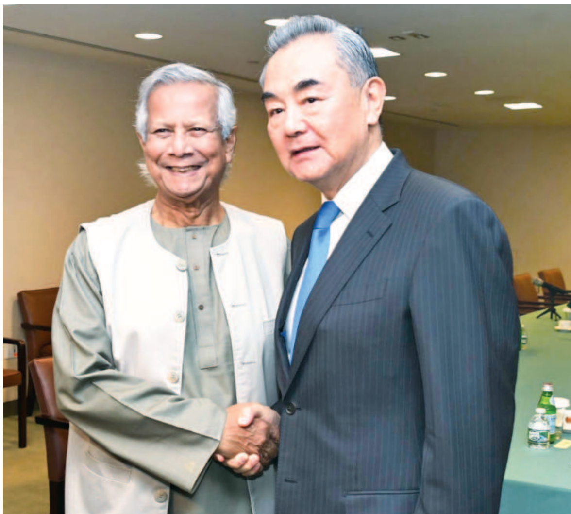
Bangladesh Chief Adviser Prof Muhammad Yunus and Chinese Foreign Minister Wang Yi exchange pleasantries on the sidelines of the UN General Assembly at the UN Headquarters in New York yesterday.