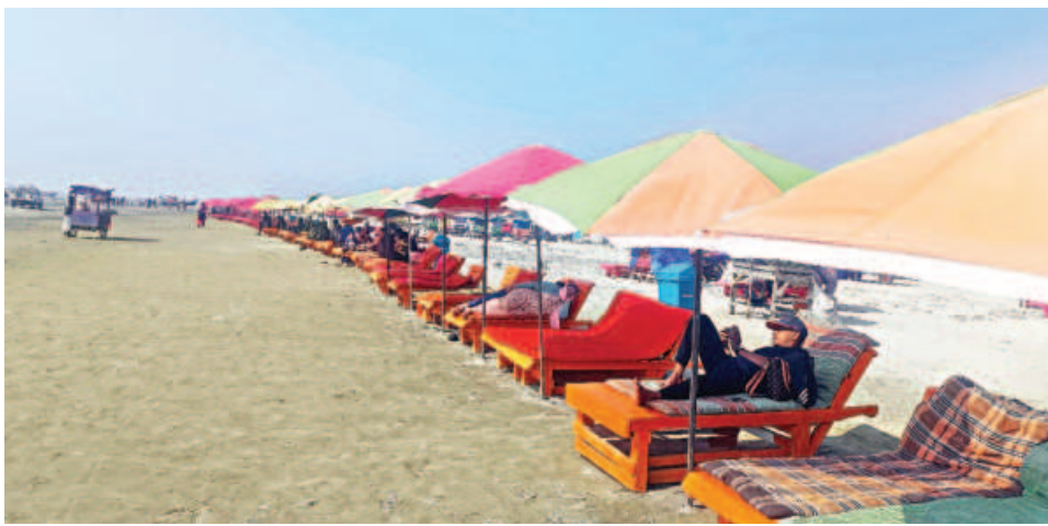
An almost empty Kuakata beach.

Polls, political unrest, floods, unfavourable weather deal a heavy blow to the sector