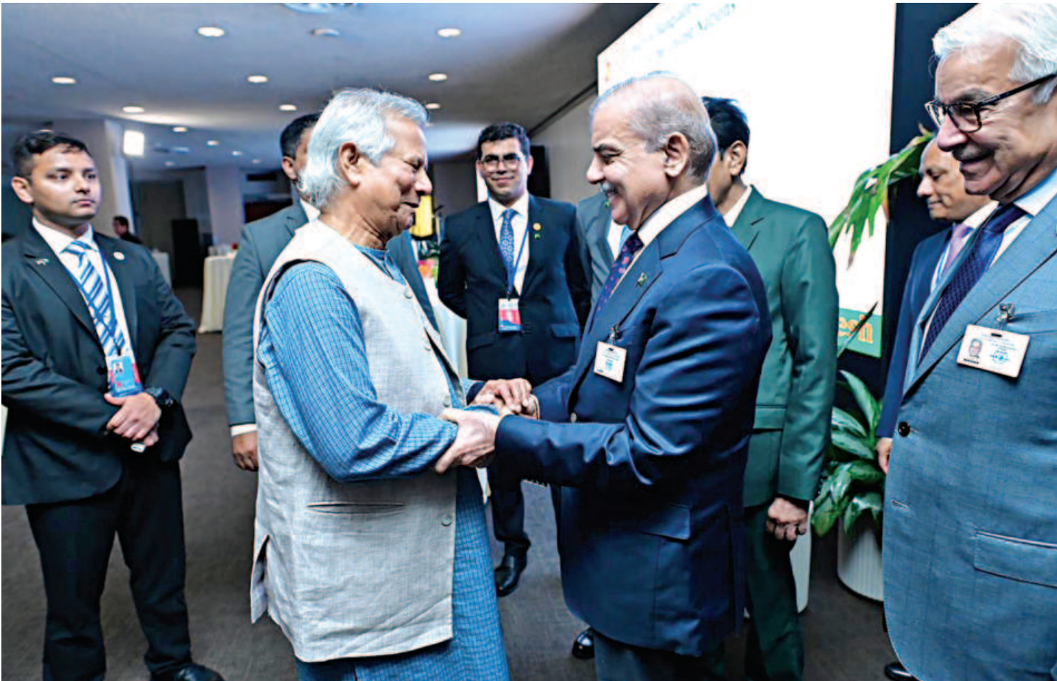
Chief Adviser Prof Muhammad Yunus greets Pakistan Prime Minister Muhammad Shehbaz Sharif before their bilateral meeting on the sidelines of UNGA in New York yesterday.