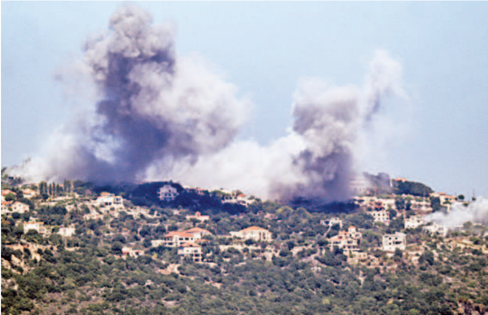
Smoke billows during an Israeli air strike on the village of Sujud in southern Lebanon yesterday.

At least 51 people were killed and around 223 wounded in Israeli strikes across Lebanon yesterday at five different locations, according to Lebanese health ministry statement.