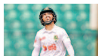
Bangladesh need Mominul to score big