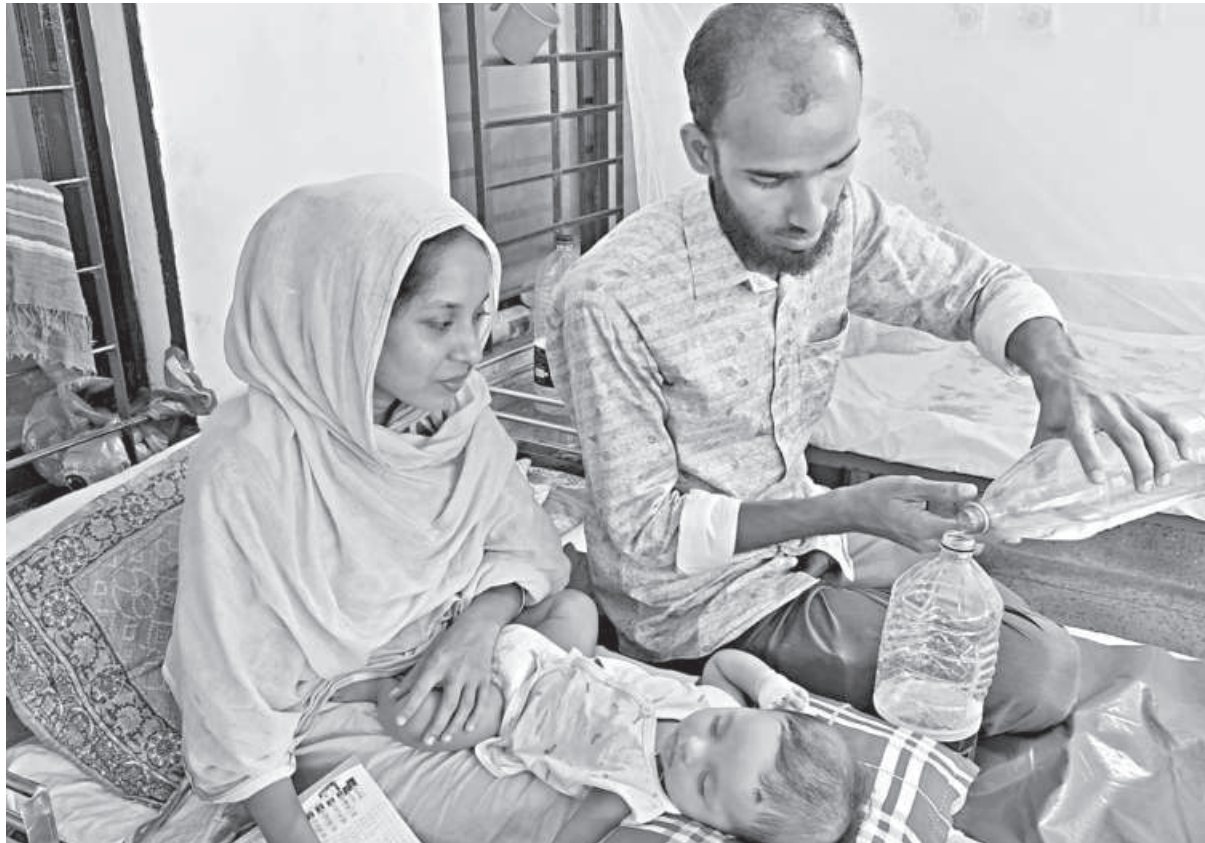
Due to sand clogging the water supply lines, patients of Barishal General Hospital have been suffering from a severe water crisis for over 30 hours. Amid the situation, patients and their attendants have resorted to various ways to manage water for hygiene and other needs. The photos were taken yesterday.