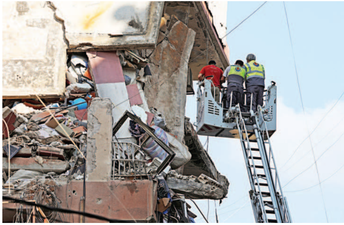
Members of the civil defence and firefighting unit work at the site of an Israeli strike in Beirut's southern suburbs in Lebanon yesterday.

"The good news is Putin's war has failed at his core aim. He set out to destroy Ukraine, but Ukraine is still free," said Biden.