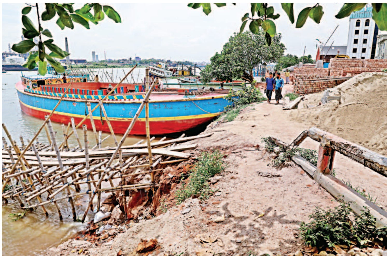
Due to a lack of maintenance and protective measures, this riverside walkway by the Buriganga, spanning from Dhaka's Shyampur to Narayanganj's Pagla area, remains in a dilapidated condition. In fact, one can hardly detect the existence of the walkway these days. The photo was taken recently.