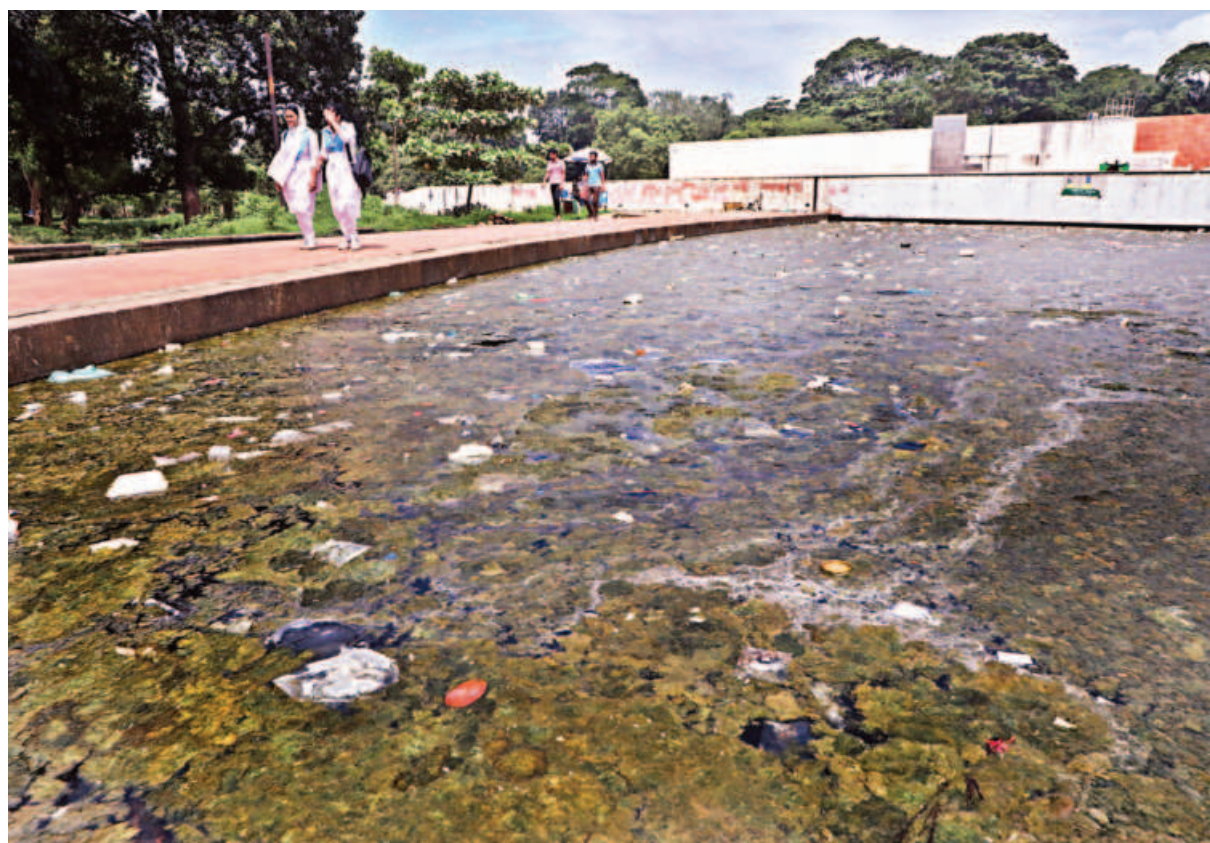
The water reservoir in front of the Swadhinata Stambha (Independence Monument) at Suhrawardy Udyan, Dhaka, was initially constructed to beautify the area. However, over time, indiscriminate littering has turned it into an eyesore, stripping it of its intended appeal. The photo was taken yesterday.