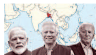
India, US both need a stable Bangladesh