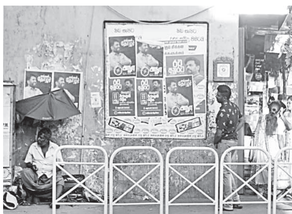
A roadside shoemaker works at his usual spot on Yatinuwara Street, Kandy, Sri Lanka, with pasted presidential election posters of AKD above his head on September 14, 2024, before the elections.

Dissanayake's presidency undoubtedly represents a critical juncture in Sri Lanka's history. If he can deliver on his promises of a people-centric economy, a decentralised political system, and social harmony, Sri Lanka may finally be able to overcome its turbulent past and chart a course towards a more just and equitable future. The road ahead is fraught with obstacles, and only time will tell whether this election marks a genuine turning point or a fleeting moment of hope.