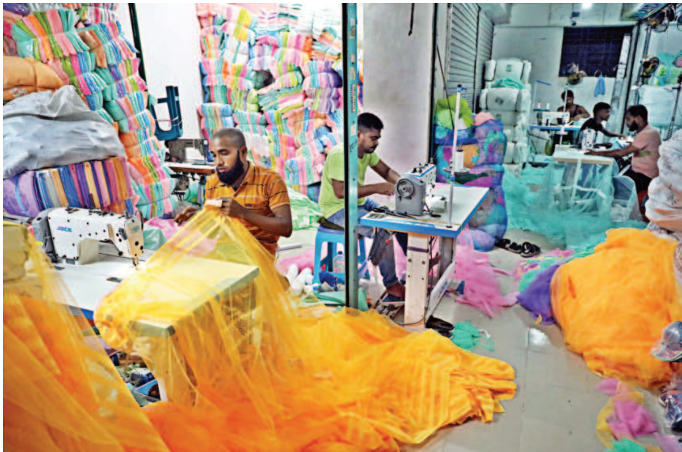
The rise in dengue cases this month has driven up demand for mosquito nets in both hospitals and households, keeping manufacturers busy this season. The photo was taken at a mosquito net manufacturing factory in the capital's Gulistan area yesterday.