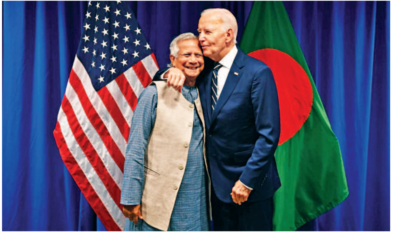
President Joe Biden and Chief Adviser Prof Muhammad Yunus hug each other during their bilateral meeting on the sidelines of UNGA in New York yesterday.