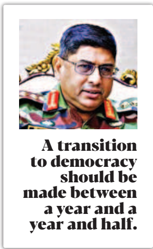
A transition to democracy should be made between a year and a year and half.