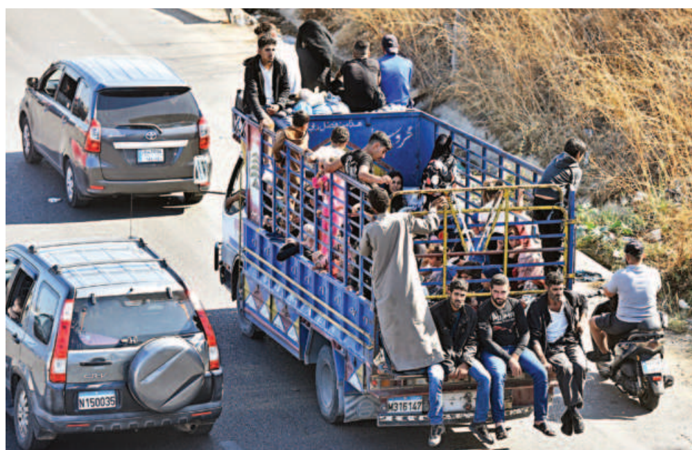
People with their belongings in the back of a truck as they arrive in the coastal town of Naameh yesterday, after fleeing their homes in southern Lebanon due to ongoing cross-border hostilities between Hezbollah and Israeli forces.