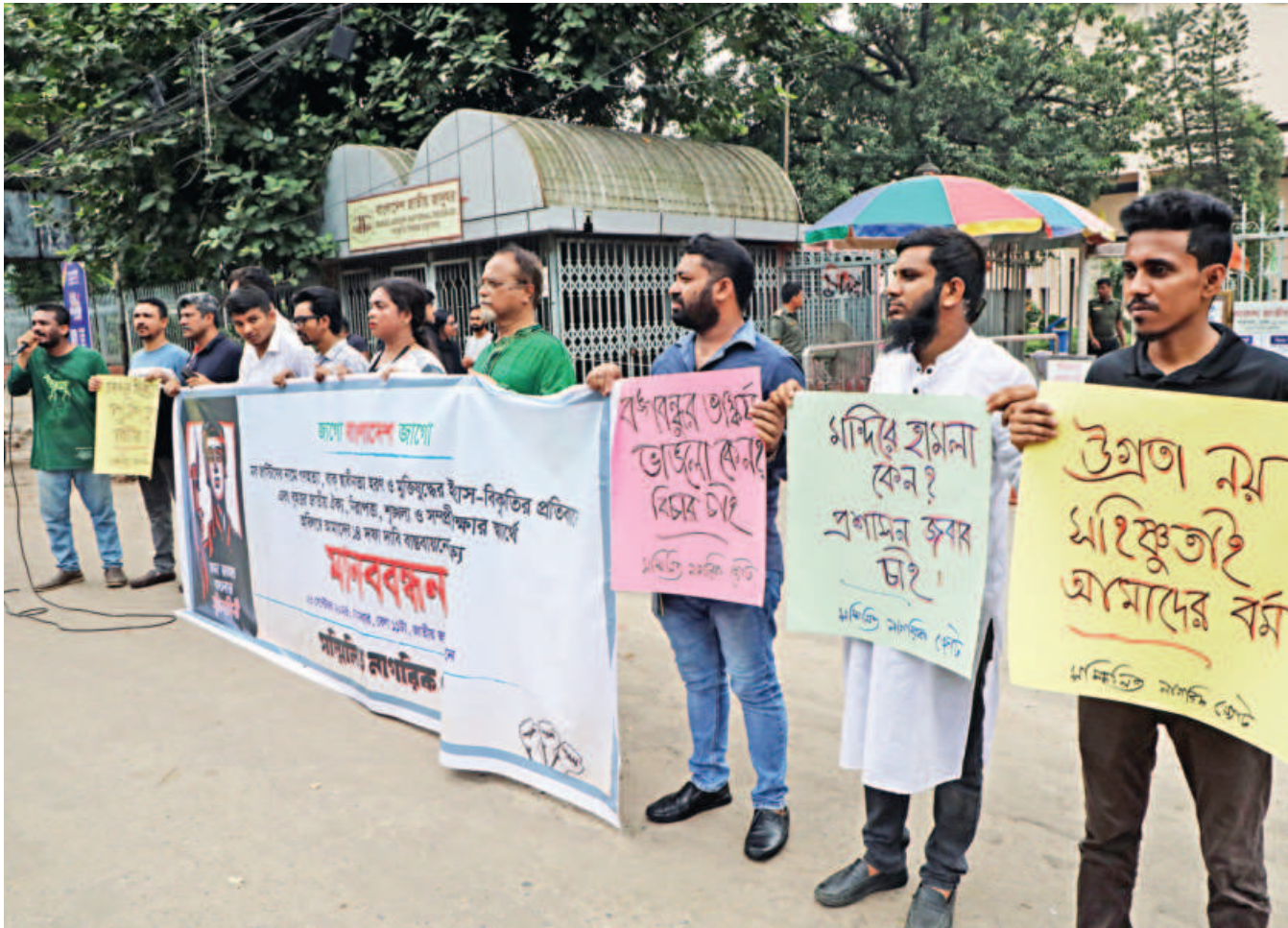
Protesting the recent upsurge in incidents of mob violence throughout the country, a human chain was formed in front of the National Museum in Shahbagh yesterday. Speakers demanded that all incidents of mob violence should be investigated and those involved should be held accountable.