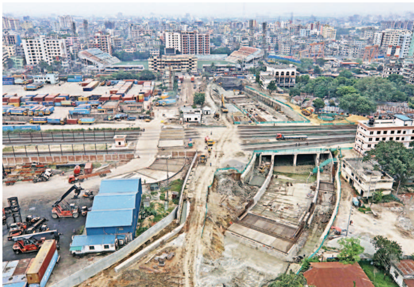
Construction of the TT Para underpass, part of the Padma Rail Link project, is progressing, albeit slowly since the recent student-led uprising that toppled the Hasina regime. The photo was taken near Kamalapur in the capital yesterday.