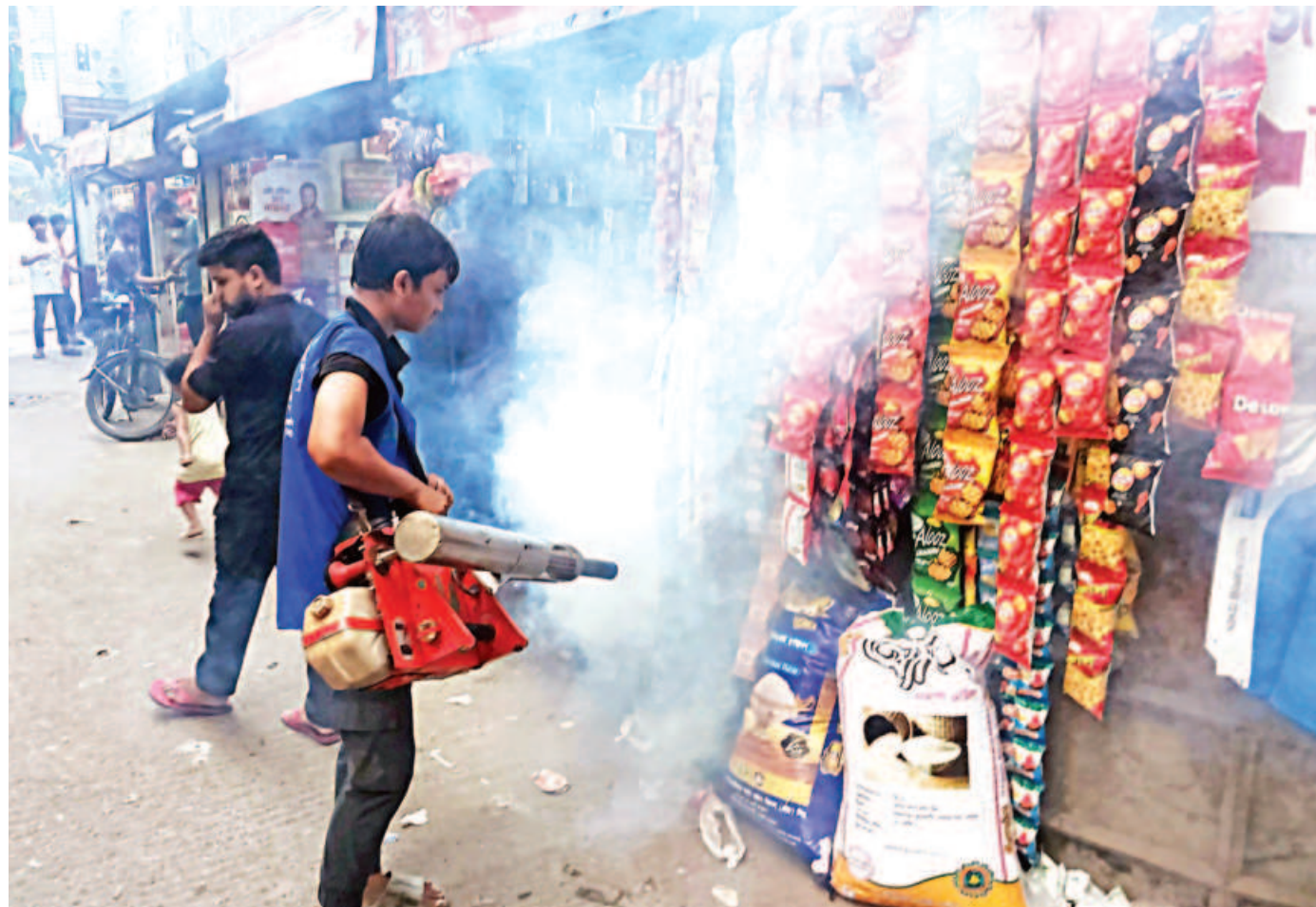
A city corporation worker sprays mosquito repellents using a fogger in the capital's East Tejuri Bazar yesterday afternoon. The city has seen a sharp rise in dengue cases over the last few weeks.