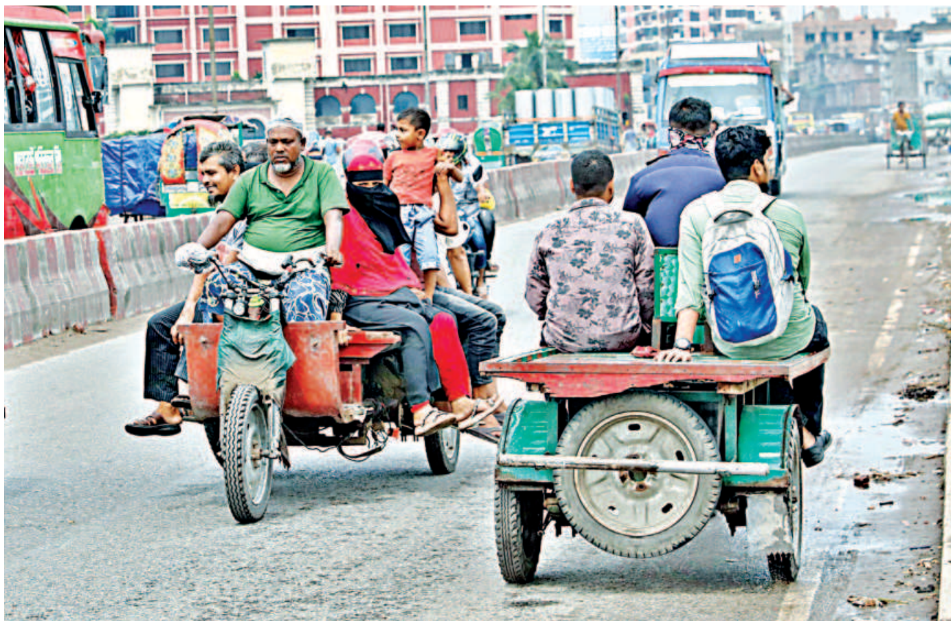
Two battery-powered illegal autorickshaws, one going the right way and the other against the traffic, transport passengers across the Second Buriganga Bridge in Badamtali yesterday. These vehicles aren't permitted to operate on the bridge as they are considered risky and prone to accidents.

Stopping the small boat arrivals on England's southern coast was a key issue in Britain's general election in July.