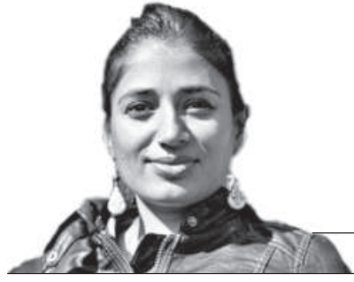
Wasfia Nazreen is a mountaineer, activist, environmentalist, social worker and writer.