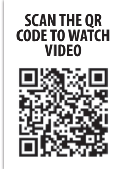
SCAN THE QR CODE TO WATCH VIDEO