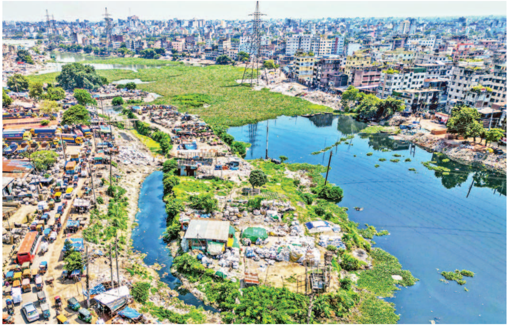
The restoration work of this old Buriganga channel along the Babubazar-Gabtolli Beribadh road, initiated by the Dhaka South City Corporation in June 2022, has seen little progress. In the meantime, land grabbers have encroached upon the river, enabling traders to set up makeshift structures for their businesses. The photo was taken on Sunday.