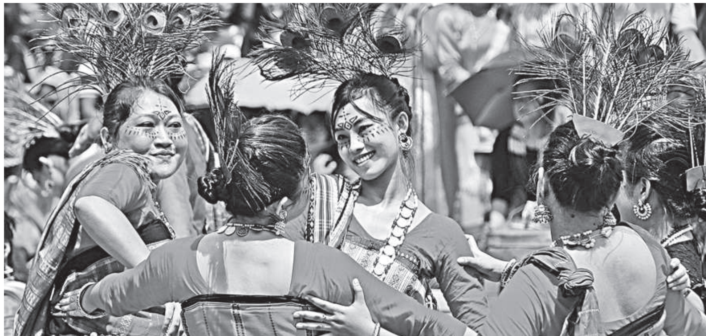
A programme held at the Central Shaheed Minar premises in Dhaka on occasion of the International Day of the World's Indigenous Peoples on August 9, 2017.

The full version of the article can be found on our website.