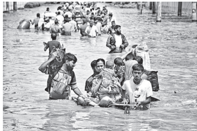
Riding a rickshaw van, a family navigate a flooded road near Feni Girls' Cadet College on their way to a shelter in Feni town on August 24, 2024.

These are some of the stories we gathered from a visit to the flood-affected areas of Noakhali and Feni on September 10-16. However, as