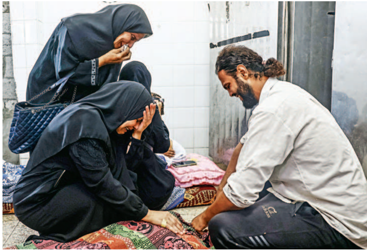
Palestinians cry as they check the bodies of victims at a hospital morgue in Deir el-Balah yesterday after an Israeli air strike hit a school sheltering displaced people in the central Gaza Strip.

"I am not a conjuror, I am not a magician, I am a common citizen," he said after taking his oath. "I have strengths and limitations, things I know and things I don't... my responsibility is to be part of a collective effort to end this crisis."