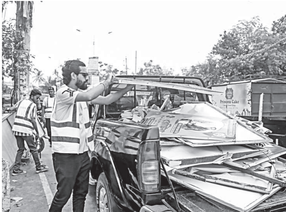
Students removing various banners and festoons of different political parties and advertisements in Khulna city yesterday. The banners were previously plastered throughout the cities, on walls, electric poles and various other spaces. This step was taken to restore the beauty of the city. The photo was taken in Khulna Boyra Women's College intersection.