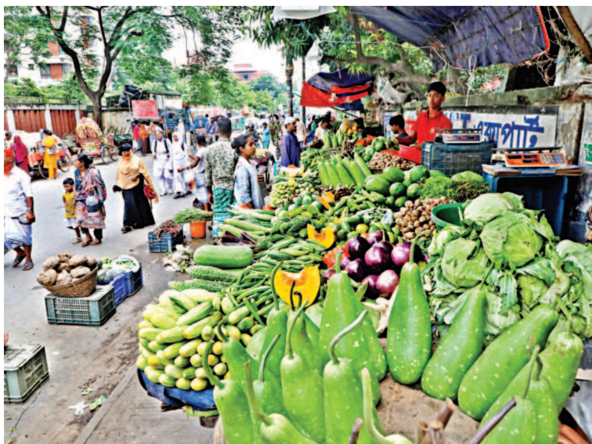
Vegetable vendors have taken up this entire footpath, leaving no space for pedestrians to walk. Many people in the background can be seen walking on the road as a result. The photo was taken in the Azimpur area yesterday.