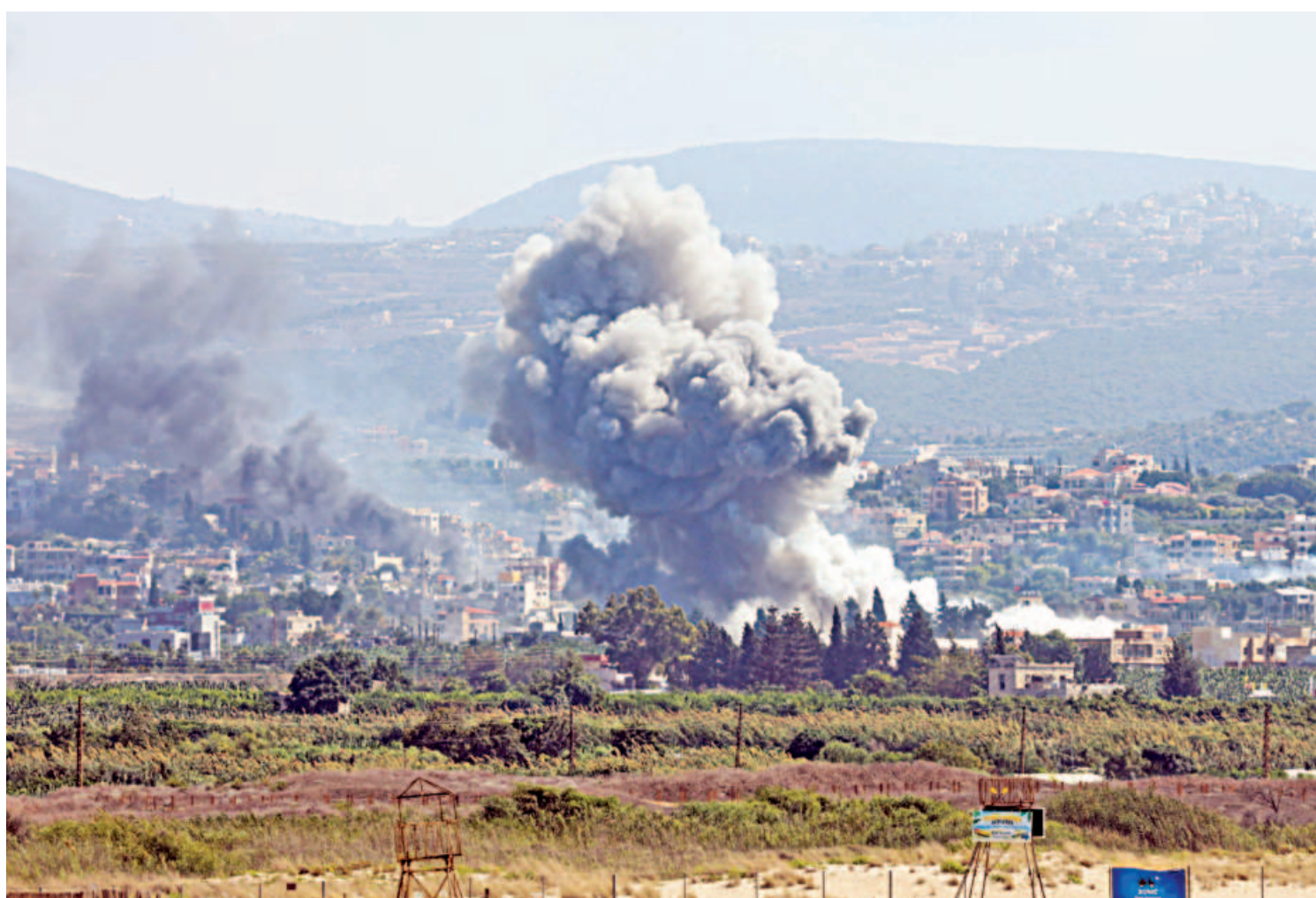
Smoke billows over southern Lebanon following Israeli strikes amid ongoing cross-border hostilities between Hezbollah and Israeli forces, as seen from Tyre in south Lebanon yesterday.