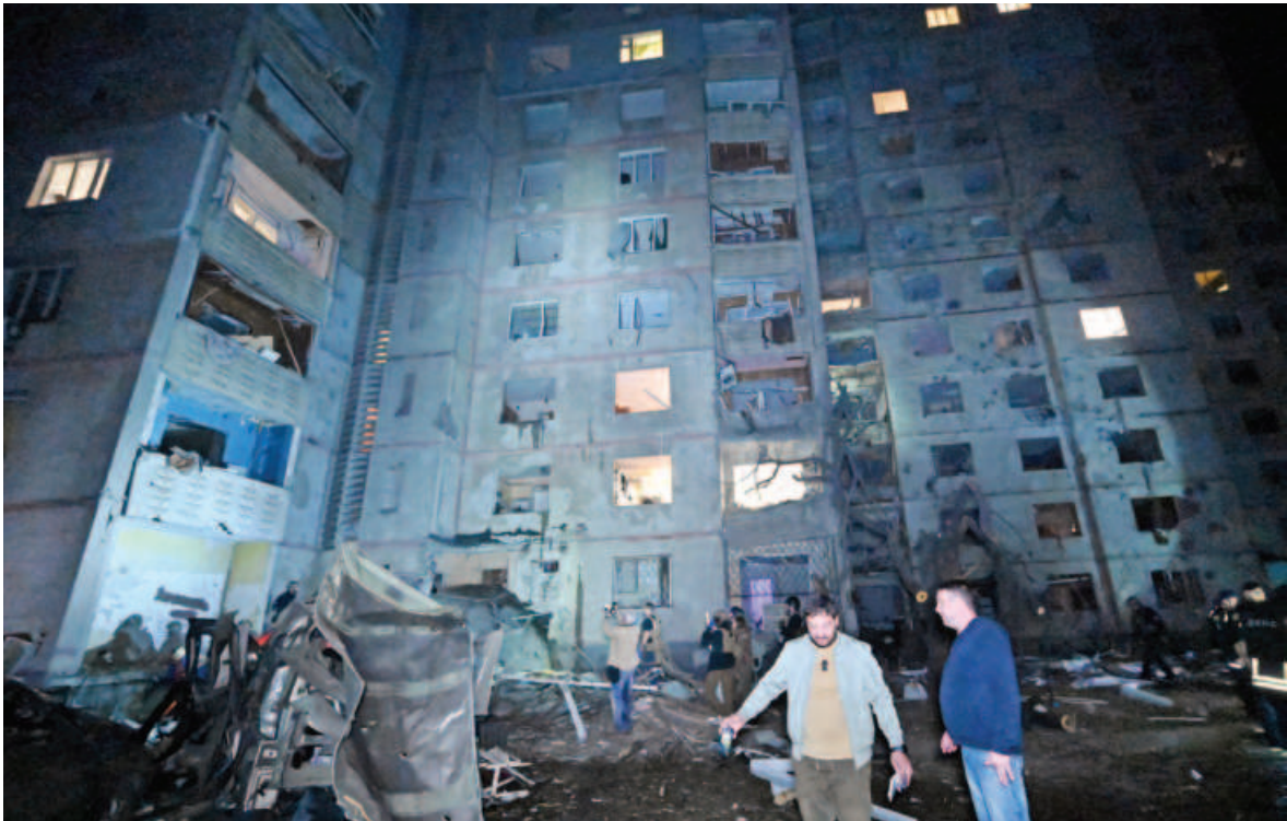
Residents stand in the courtyard of a damaged residential building following a Russian missile attack in Kharkiv, Ukraine early yesterday. At least 21 people, including three minors, were injured in the missile strike, the regional governor said.