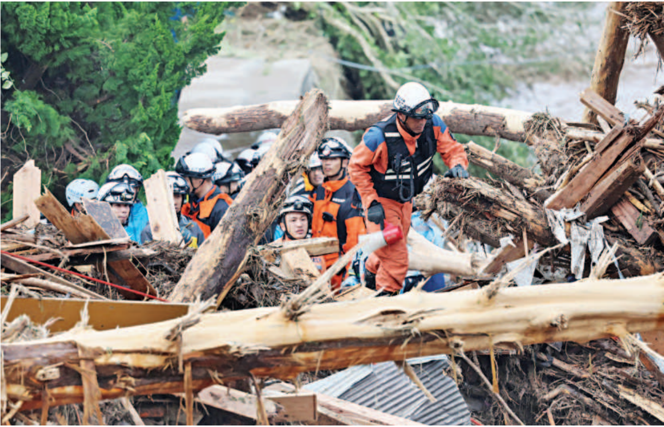
Firefighters search through debris for missing people washed up after heavy rains caused flooding, in the city of Wajima, Ishikawa prefecture in Japan yesterday. Floods and landslides killed one person and left at least 11 missing in central Japan.