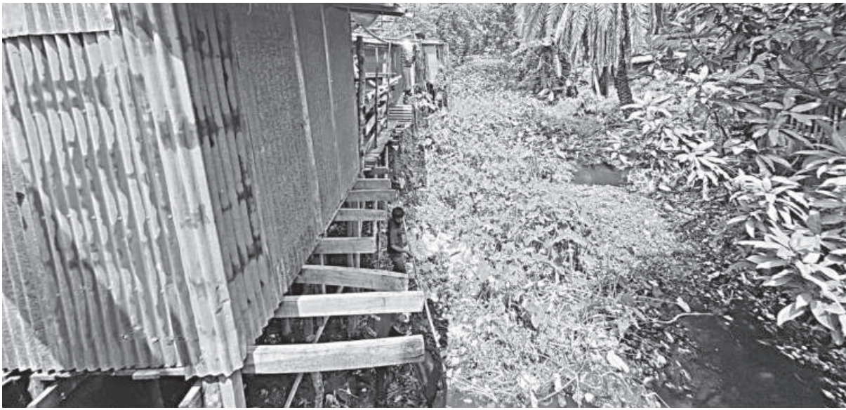
Once vibrant, Barishal's Rayer Khal is now on deathbed due to pollution and encroachment. The photo was taken near Lakutia road yesterday.