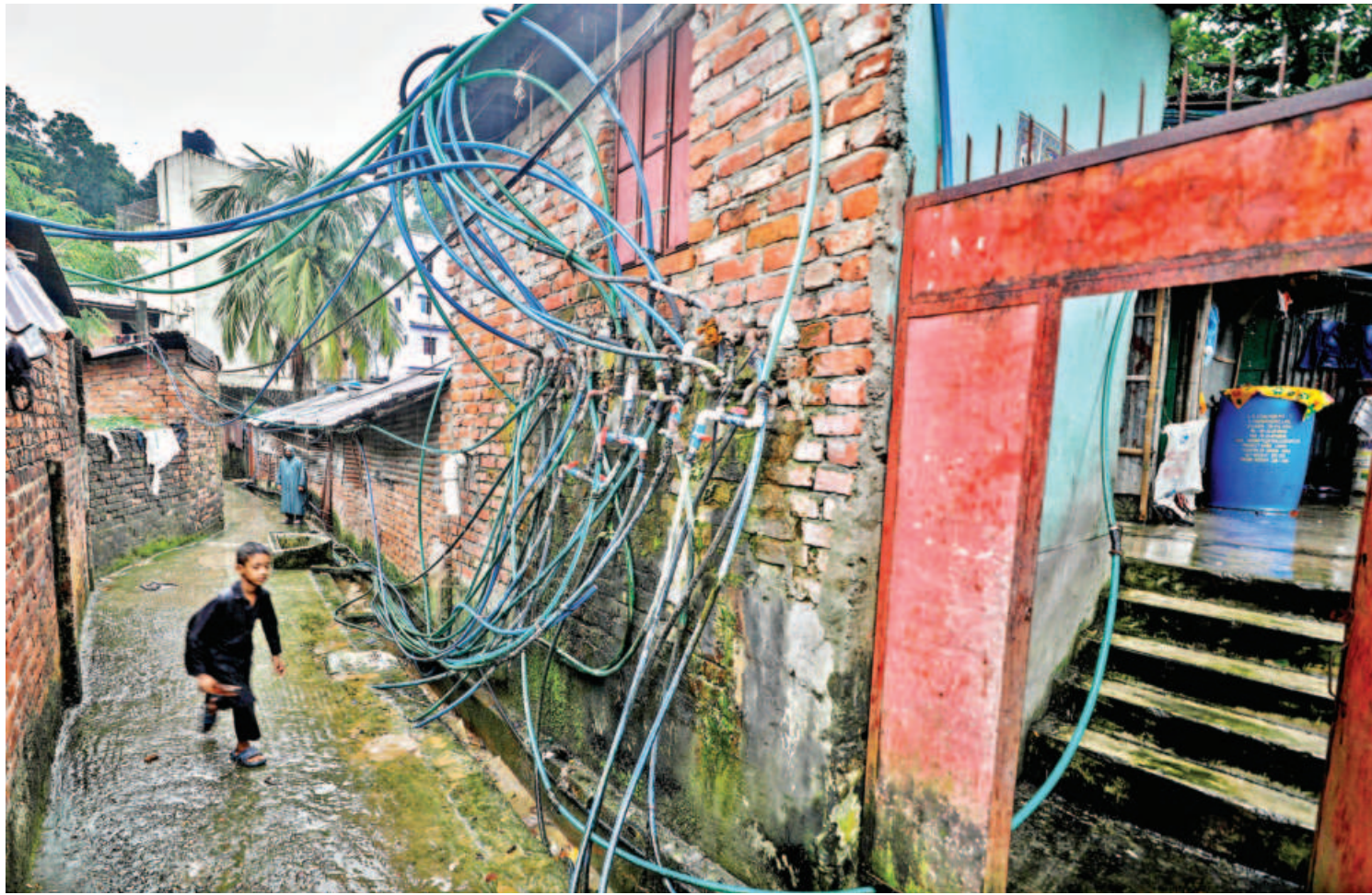
In the Lalkhan Bazar area of Chattogram, numerous houses have been constructed along the hillsides, relying on an illegal network of water connections. The residents have to pay up to Tk 1,000 per month to intermediaries for a mere 15 to 20 minutes of water supply each day. The photo of the tangled waterpipe lines was taken recently.