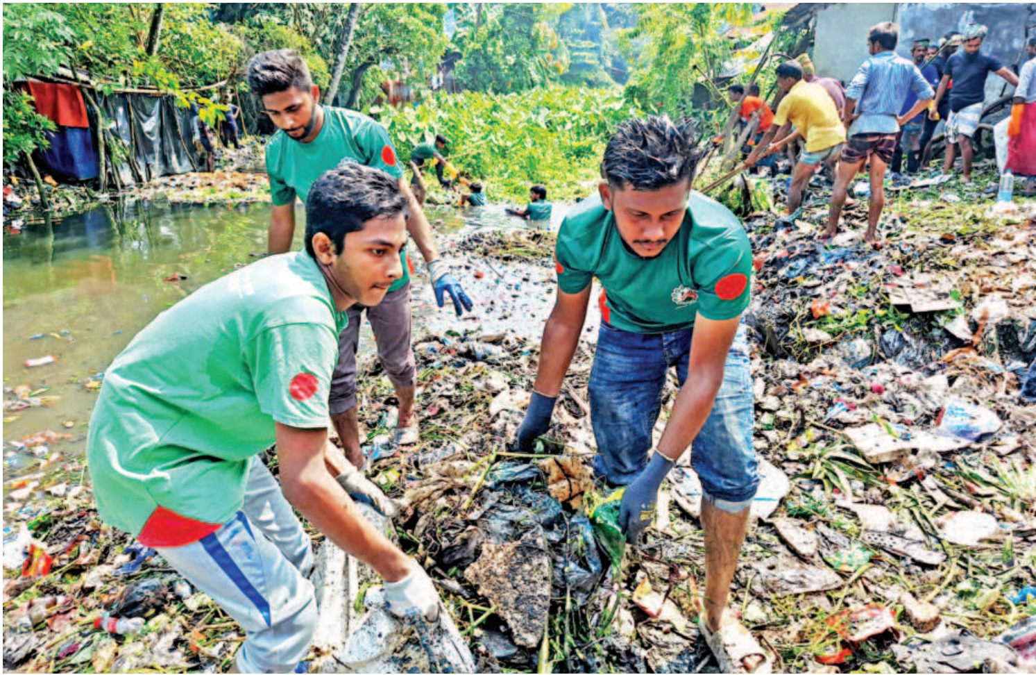
In an effort to resolve waterlogging and restore the flow of rivers in the district's canals, a cleaning campaign was organised by the district administration in Barishal city. Workers, volunteers, and students from different colleges participated in the campaign. The photo was taken from the Morok Kholar Pool area yesterday.

Later on September 13, police filed a case against them with Kotwali Police Station.