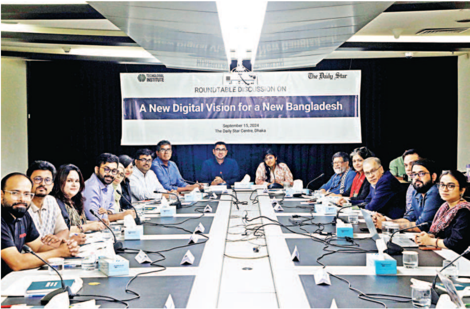
Speakers at a roundtable on "A New Digital Vision for a New Bangladesh" yesterday. The event was organised jointly by Tech Global Institute and The Daily Star at the capital's The Daily Star Centre.