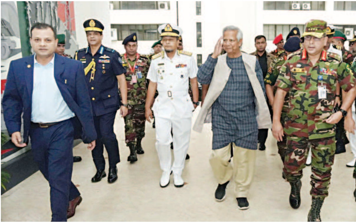
Chief Adviser Prof Muhammad Yunus visits the Army Headquarters in Dhaka for the first time yesterday. Upon his arrival, he was welcomed by Chief of Army Staff General Waker-Uz-Zaman.