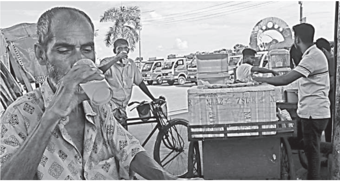
A rickshaw-puller quenches his thirst with a cold beverage on the roadside. The recent heatwave over the country has left people and animals throughout suffering. The temperature in Sylhet was 34 degrees Celsius yesterday. The photo was taken in the Keane Bridge area recently.