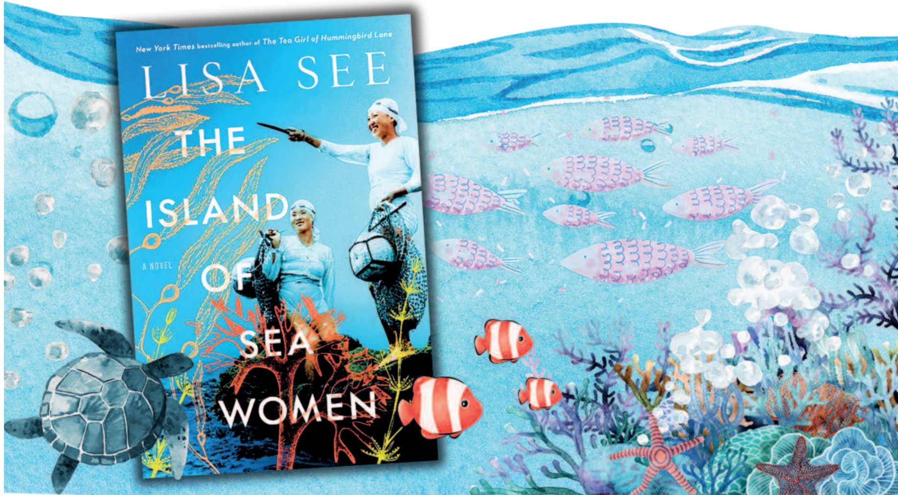
ILLUSTRATION: MAISHA SYEDA