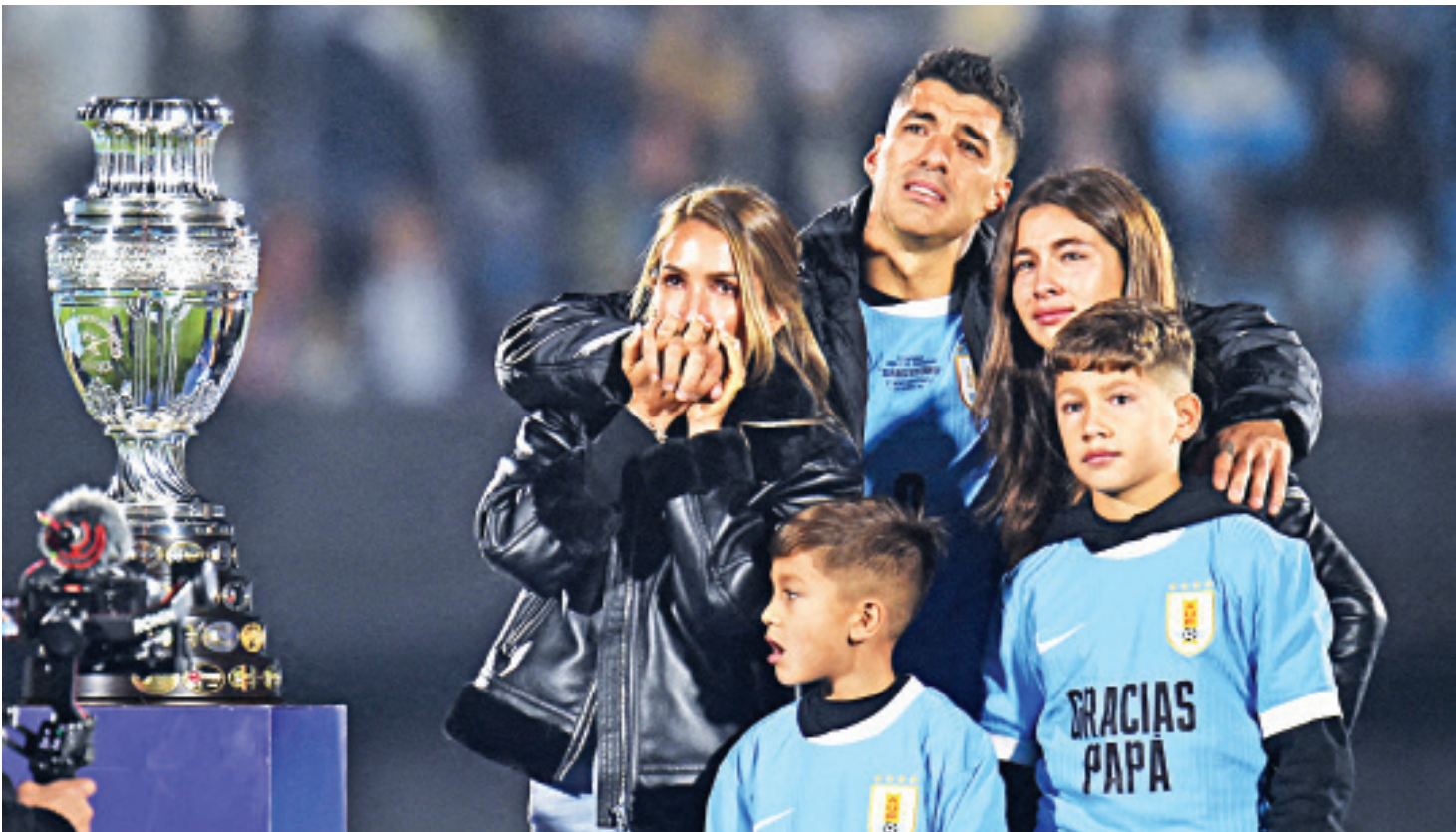
An emotional Luis Suarez and his family stand next to a replica of the Copa America trophy he was presented during his farewell ceremony after the 2026 FIFA World Cup South American qualifiers match at the Centenario Stadium in Montevideo on Friday. Suarez, however, bade a frustrating farewell to his 17-year international career as Uruguay were held to a 0-0 draw by Paraguay. The 37-year-old forward reached 143 appearances for his country, finishing as their all-time leading scorer with 69 goals.