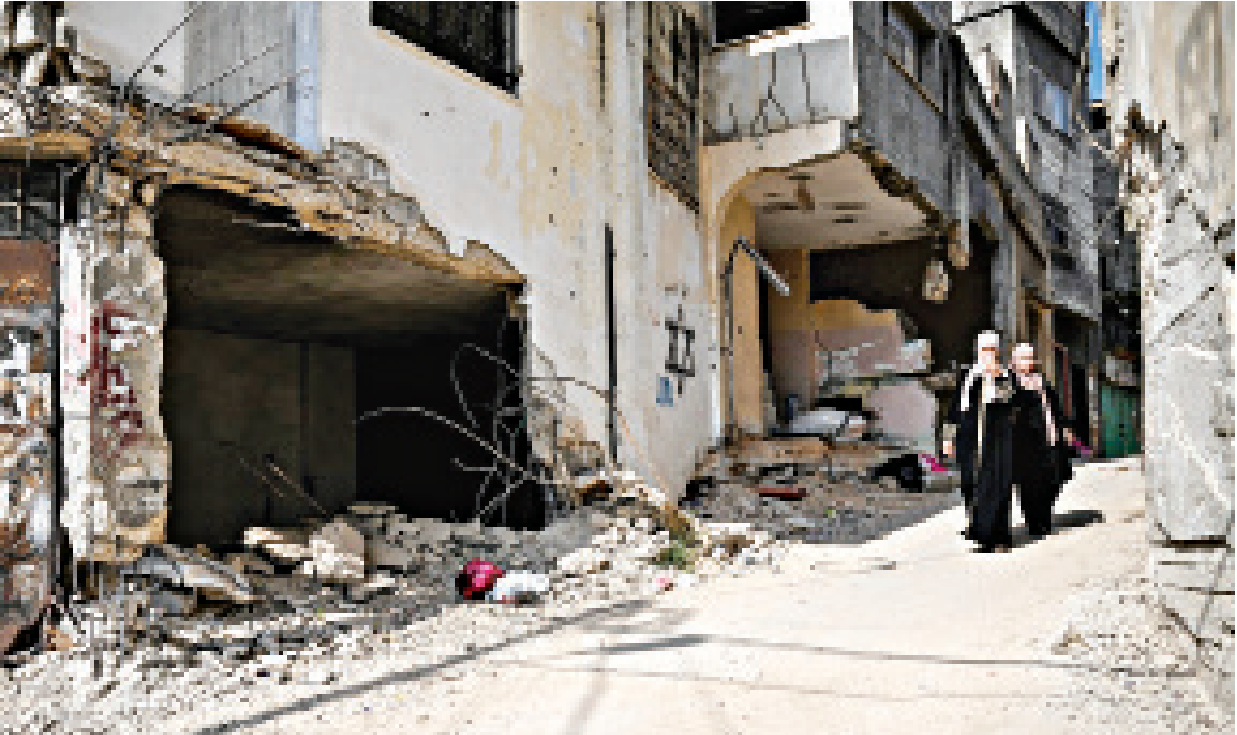
Residents walk amid the destruction following an Israeli military raid in the Jenin refugee camp in the occupied West Bank yesterday.

The accused also allegedly vandalised BNP offices, businesses, and homes, looted properties, and set them on fire, said the case details.