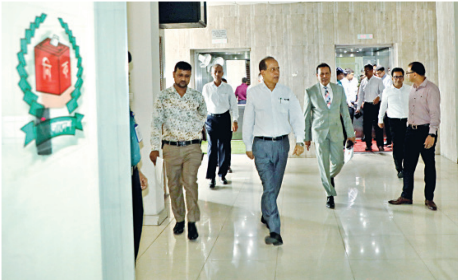
Chief Election Commissioner Kazi Habibul Awal walks out of the Election Commission office in the capital yesterday after submitting his resignation to the EC secretary. Besides him, all four election commissioners also resigned.

Lili demanded equal treatment for sex workers in death and burial arrangements, without discrimination.