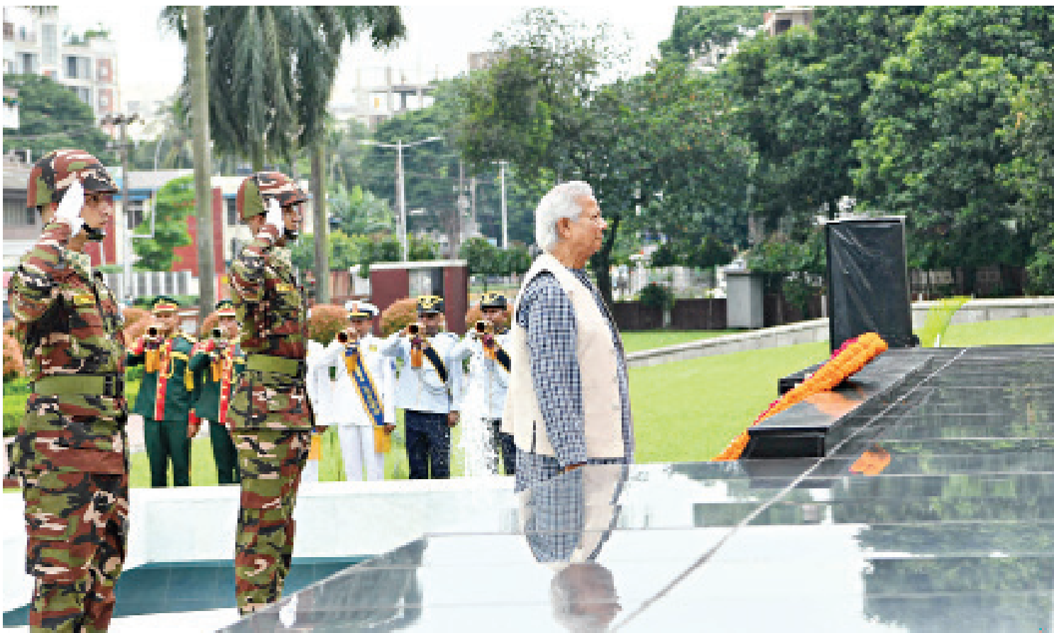
Chief Adviser Prof Muhammad Yunus pays tribute to the Armed Forces Division by placing a floral wreath at the Shikha Anirban inside the army headquarters yesterday. Prof Yunus, who visited the division as part of his official duties, laid the wreath to honour the sacrifices and dedication of the members of the Armed Forces.