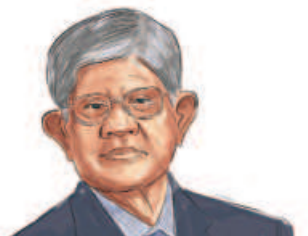
Dr Salehuddin Ahmed