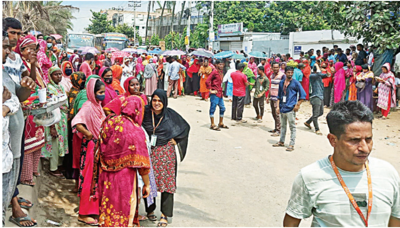
Workers from a factory stage a demonstration blocking off the Nabinagar-Chandra highway at Palashbari area in Ashulia, around 23 kilometres north of capital Dhaka, yesterday demanding resumption of different employment benefits. The army and police later dispersed the protesters. The photo was taken around 11:30am.

Situation normal in Gazipur, pharma tensions also ease