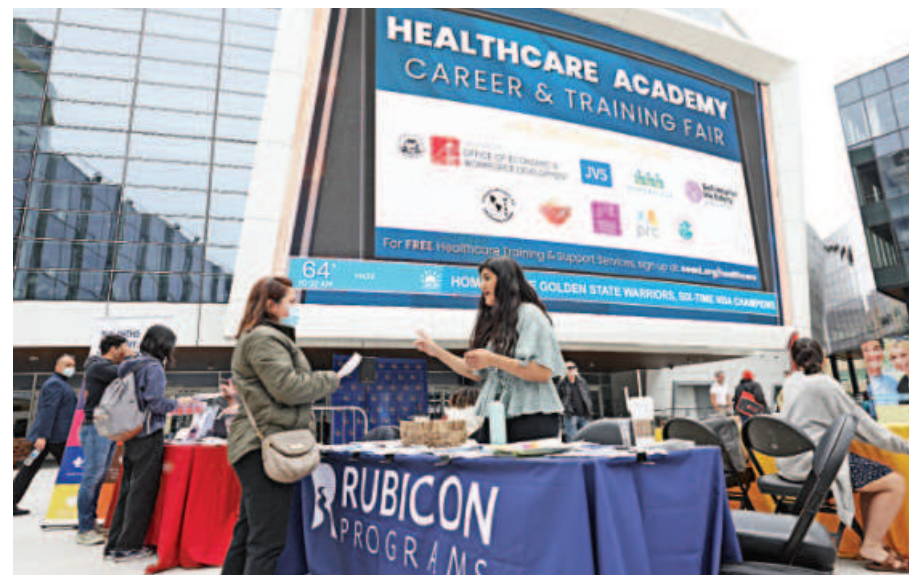
A job seeker meets with a recruiter during the Healthcare Academy career and training fair outside the Chase Center in San Francisco, California.

The layoffs rate rose to a still low 1.1 percent from 1.0 percent in June. Low layoffs were underscored on Wednesday in the Fed's "Beige Book" report, which reported that five of the U.S. central bank's districts saw slight or modest increases in overall headcounts in late August.