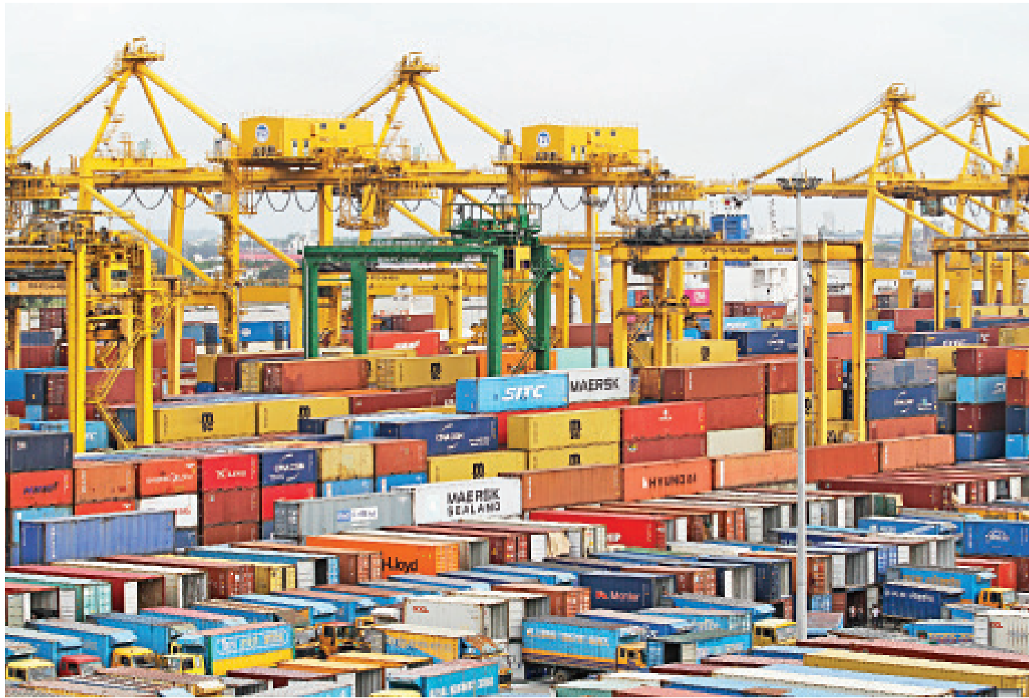
Usually, over 5,000 twenty-foot equivalent units (TEUs) of import-laden containers are delivered daily to consignees as well as transferred to private inland container depots (ICDs) from the Chattogram port. On the other hand, around 1,800 to 2,000 TEUs of export-laden containers are transported from the 21 private ICDs to the port for shipment on an average day. The photo was taken last month. PHOTO: RAJIB RAIHAN

The German government has forecast 0.3 percent growth this year but that figure is looking increasingly ambitious. The Ifo economic institute on Thursday lowered its full-year outlook for the country. It now expects the German economy to stagnate in 2024, after previously predicting 0.4 growth.