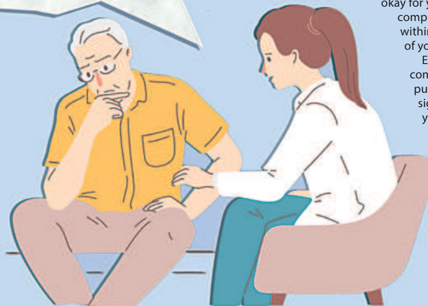
ILLUSTRATION: SYEDA AFRIN TARANNUM