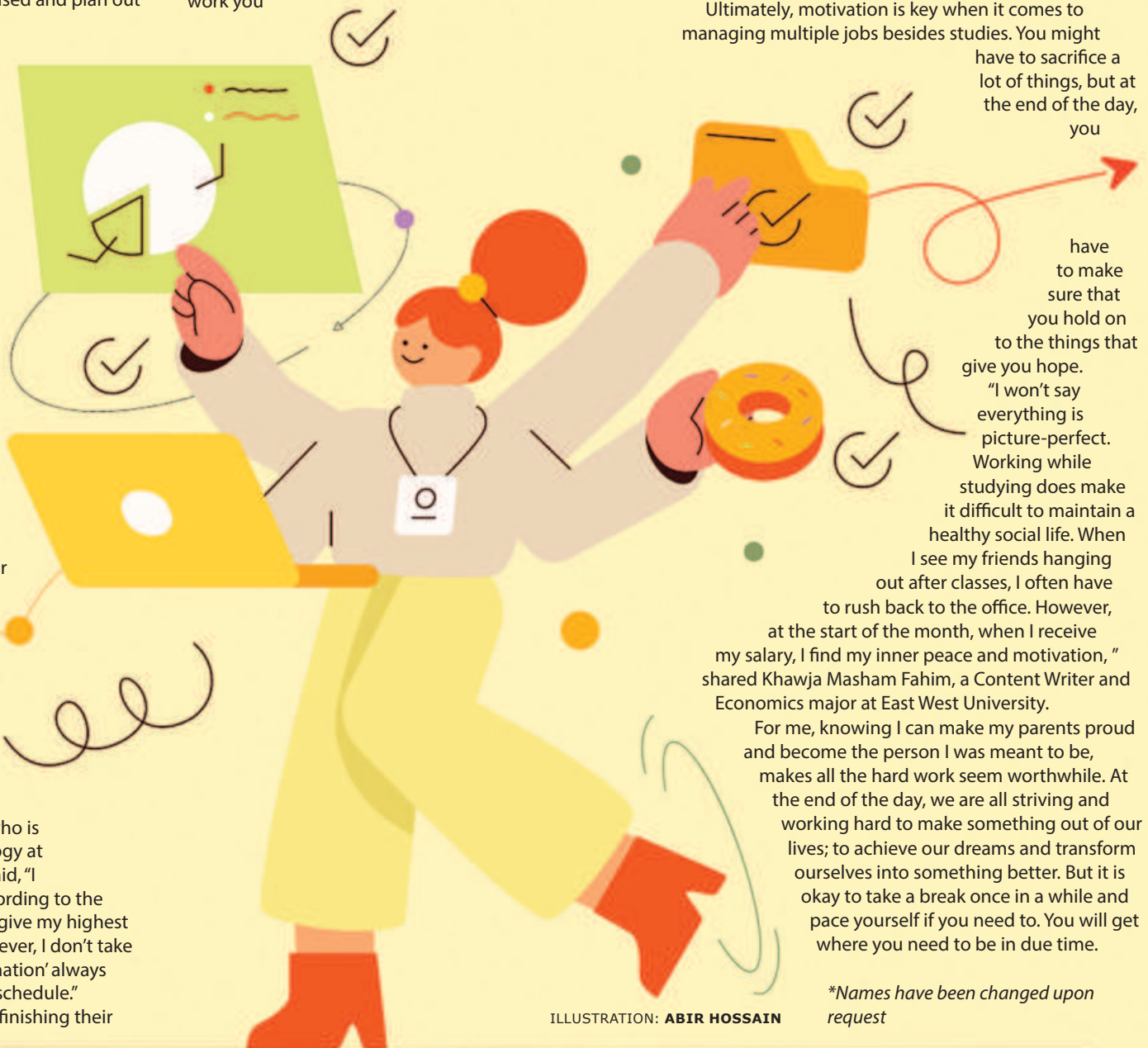
ILLUSTRATION: ABIR HOSSAIN