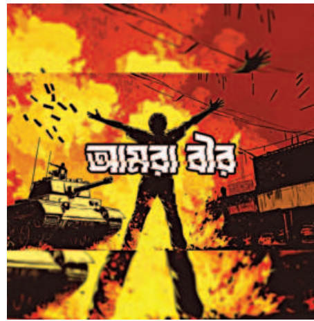
AMRA BIR (Oni Hasan, Kazi Zohad Yazdani)

Oni Hasan's rock n' roll composition roars with a heavy and gnarly guitar riff and consistent growls to feed into the brutality of the song. It acknowledges everyone's valiant contributions to freeing the country from the shackles of fascism and urges them to remain unwavering in their efforts.