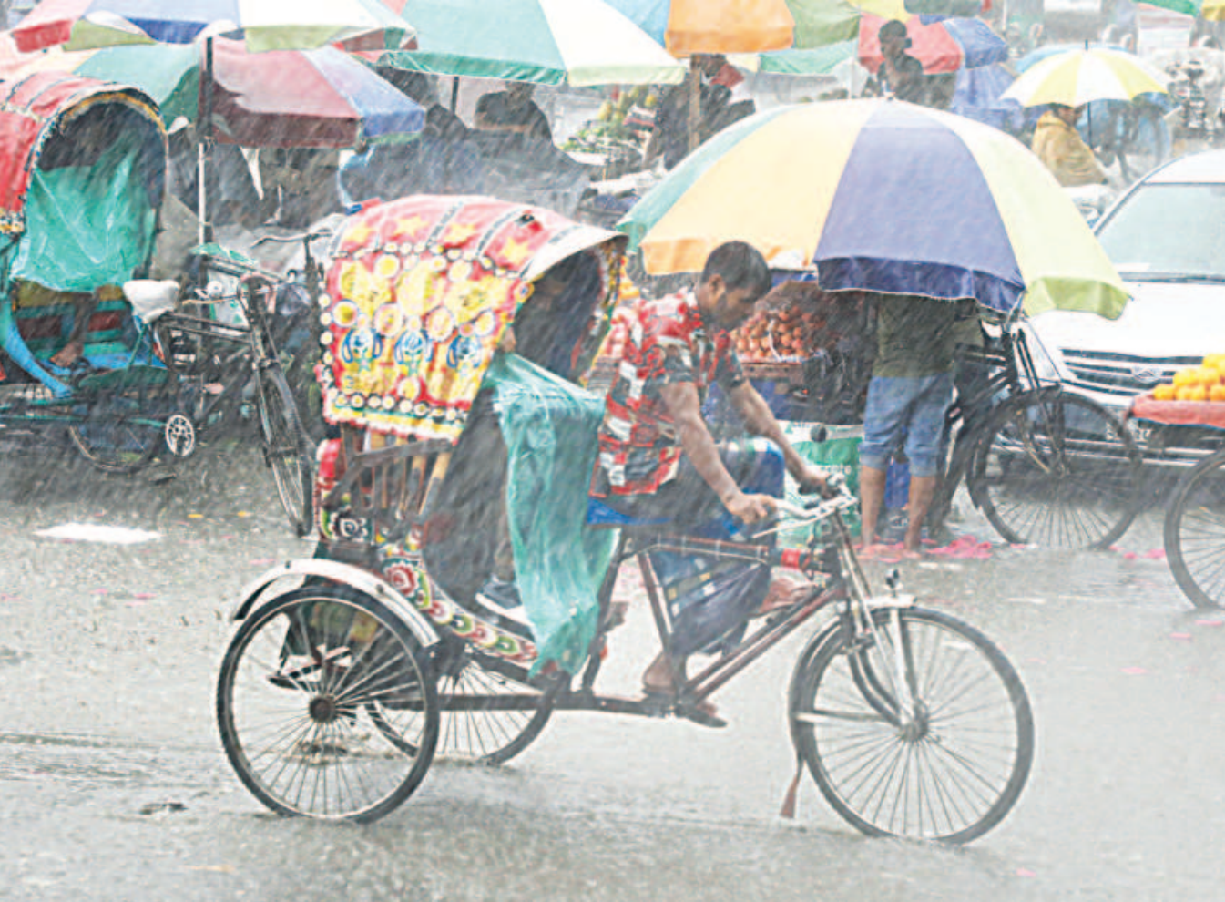
A rickshaw-puller rides through the streets amid downpour that drenched the capital from morning until afternoon yesterday. Without a raincoat, he likely spent the rest of the day in wet clothes. This photo was taken in the Karwan Bazar area recently.