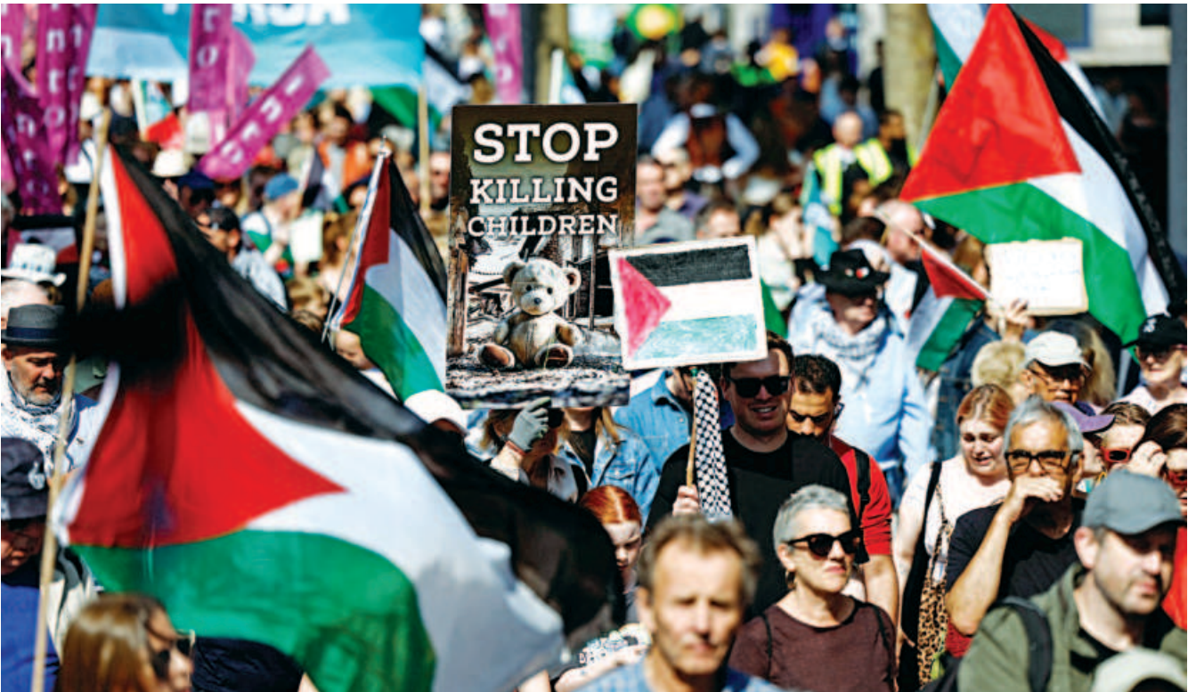
People protest calling for an end to the Israeli offensive in Gaza during a demonstration in solidarity with Palestinians in Dublin, Ireland, yesterday.

"We now only have 73 days before COP29 begins and Parties need to accelerate their engagement on this top negotiating priority to reach consensus," COP29 President-Designate Mukhtar Babayev said.