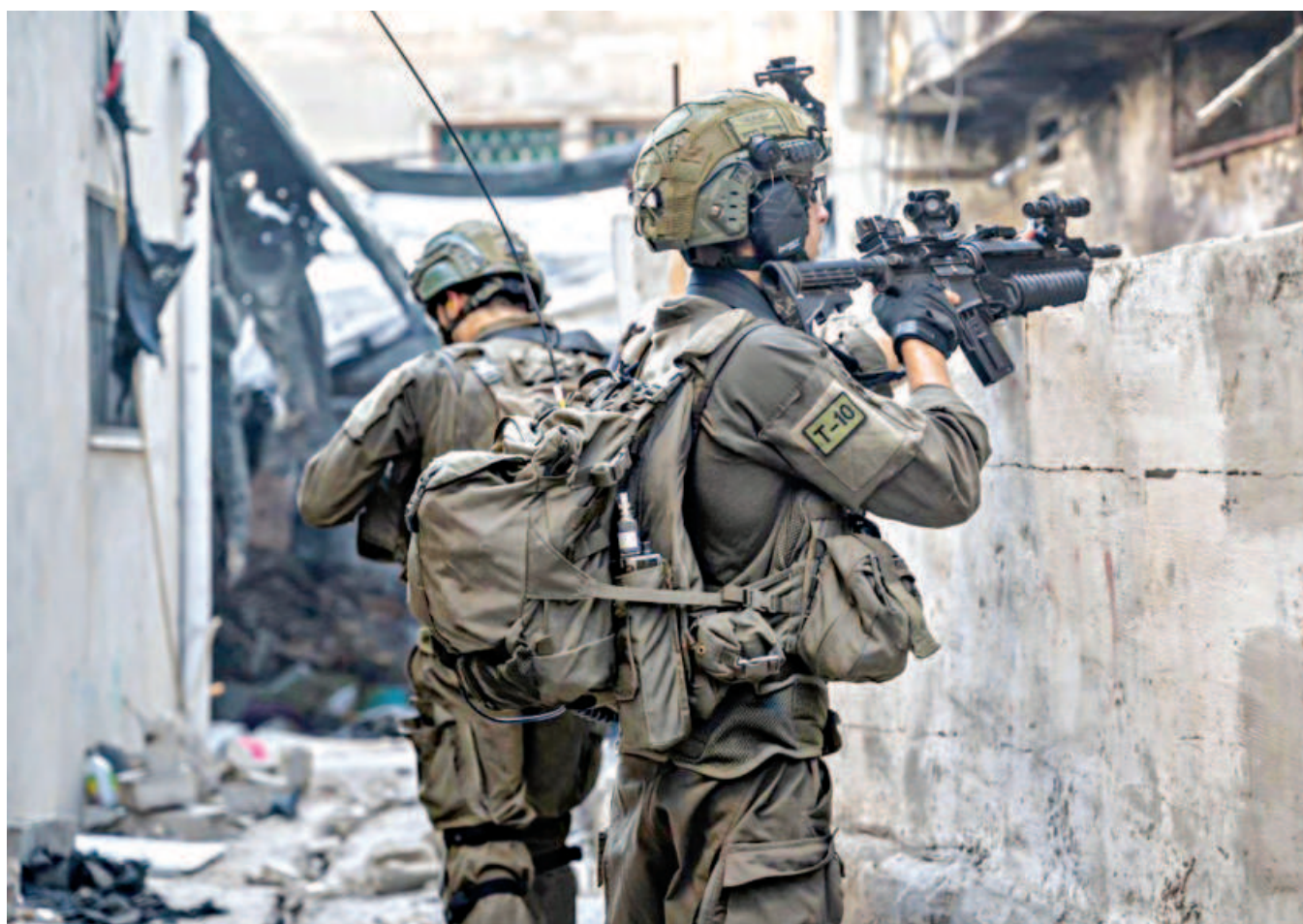
This handout picture released by the Israeli army yesterday reportedly shows Israeli soldiers operating in Jenin in the occupied West Bank.