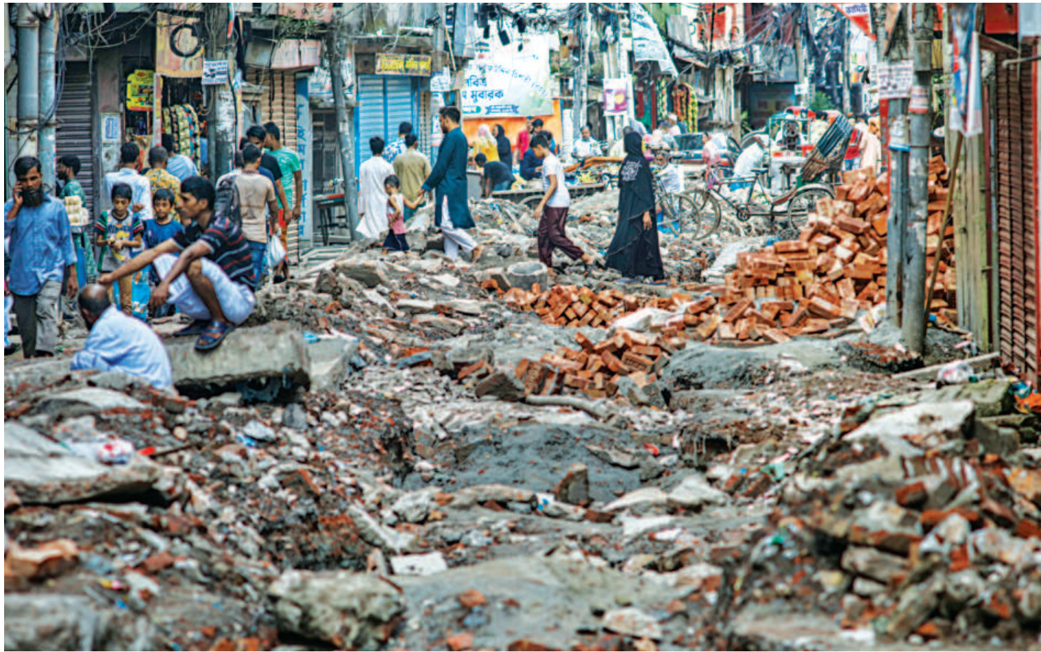
The authorities have dug up Nazimuddin Road in Old Dhaka to carry out drainage work, which has been going on for over six months. Slow progress of the work is causing difficulties for the road users. The photo was taken yesterday.