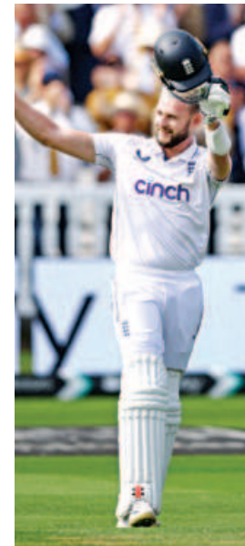
Gus Atkinson cemented his love affair with Lord's by scoring a maiden century on Friday, with his 118 powering England to an imposing first-innings 427 all out against Sri Lanka on the second day of the second Test. The 26-year-old had taken 12 wickets on his debut at the same venue against the West Indies last month. The lanky pacer later took a wicket as England reduced the visitors to 129 for seven at tea.

*Read full stories on The Daily Star's website