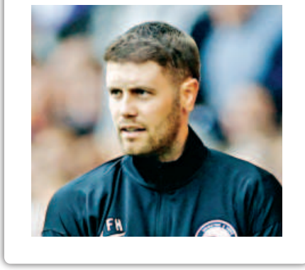
"It's very unfortunate. Yesterday he had a collision and got a shoulder injury. He's going to be out for a few weeks. It's really bad luck and we were all very excited. He was looking very good, but he landed

on the floor; Gabi went on top of him and it looks like he's got a small fracture probably. He was in so much pain, so we have to wait and see with the staff to do some more tests to have more conclusive answers," Arteta said.