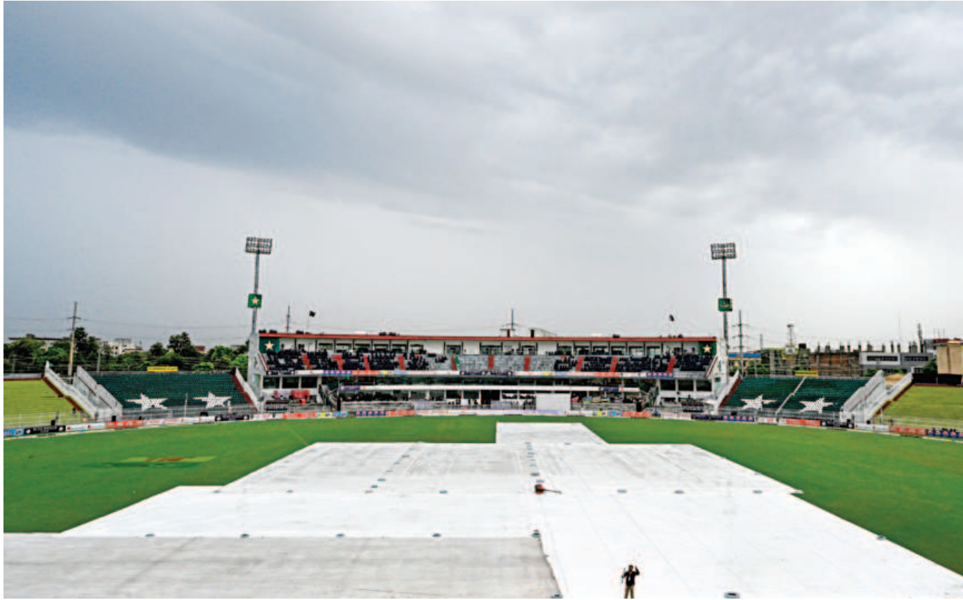
Persistent rain and wet outfield forced the opening day's play of the second Test between Bangladesh and Pakistan to be called off without toss at the Rawalpindi Cricket Stadium yesterday. However, weather forecasts suggest that Rawalpindi will enjoy bright sunshine today. The tourists are leading the two-match series 1-0 following their 10-wicket win in the first Test at the same venue last week.

"We had nothing to do during the rain. We had to sit idle most of the time as there was no indoor facility here," he concluded.