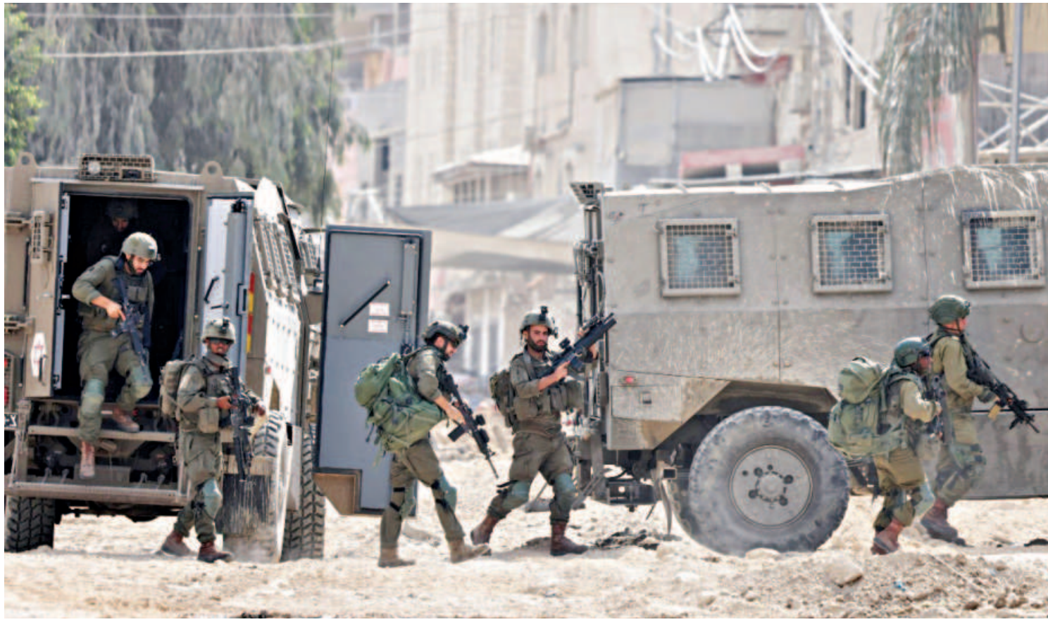
Israeli soldiers operate during a raid in the Nur Shams camp for Palestinian refugees near the city of Tulkarem in the Israeli-occupied West Bank yesterday. At least 9 Palestinians were killed in Israeli raids and strikes in several towns in the north of the occupied West Bank, a spokesman for the Red Crescent said.

Monsoon rains cause widespread destruction every year, but experts say climate change is shifting weather patterns and increasing the number of extreme weather events.