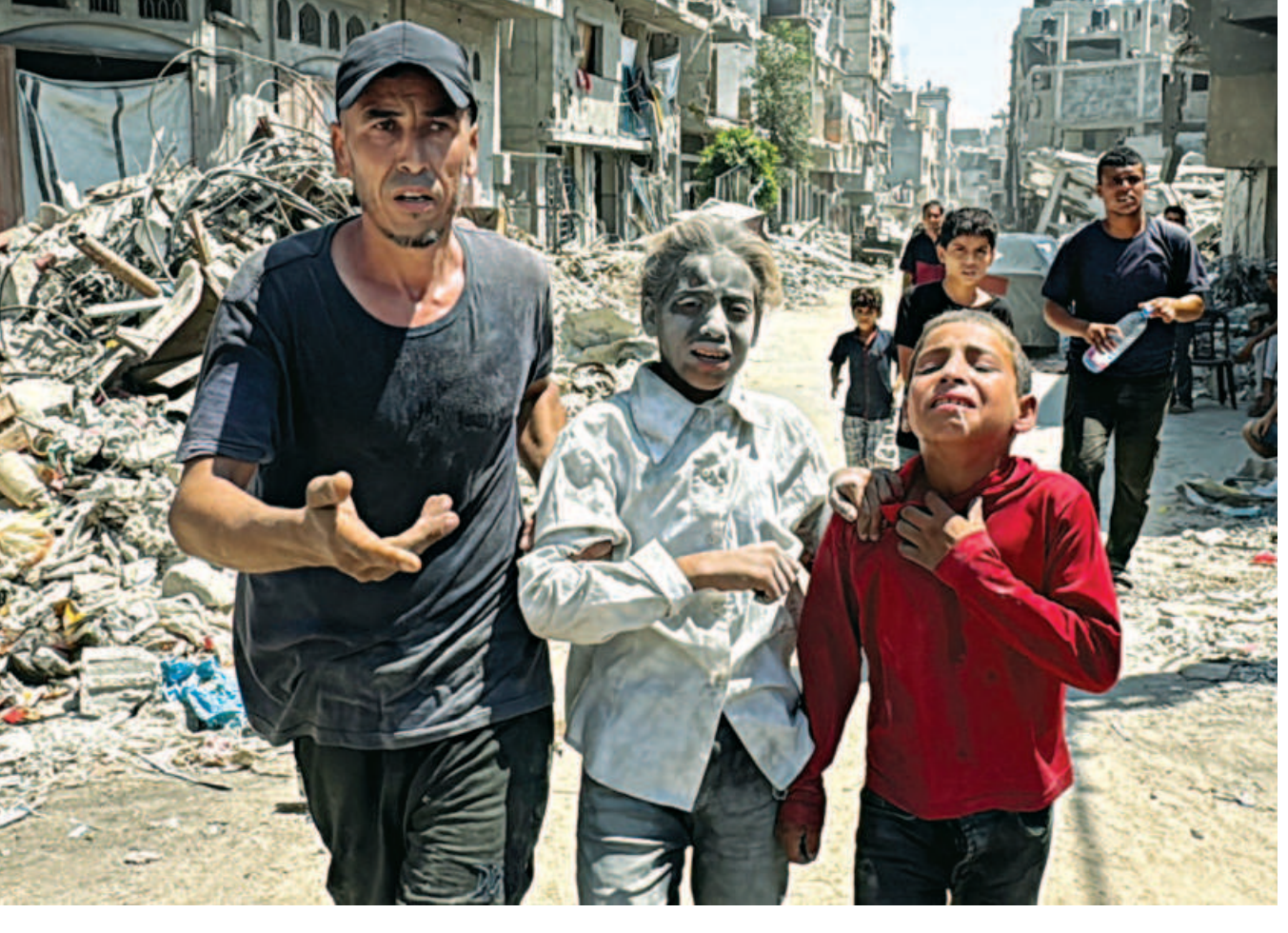
Palestinians evacuate injured children at the site of an Israeli strike that destroyed several houses in Khan Younis in the southern Gaza Strip yesterday.

"Following Sheikh Hasina's resignation amid mass protests, Bangladesh's interim government has the heavy SEE PAGE 10 COL 1