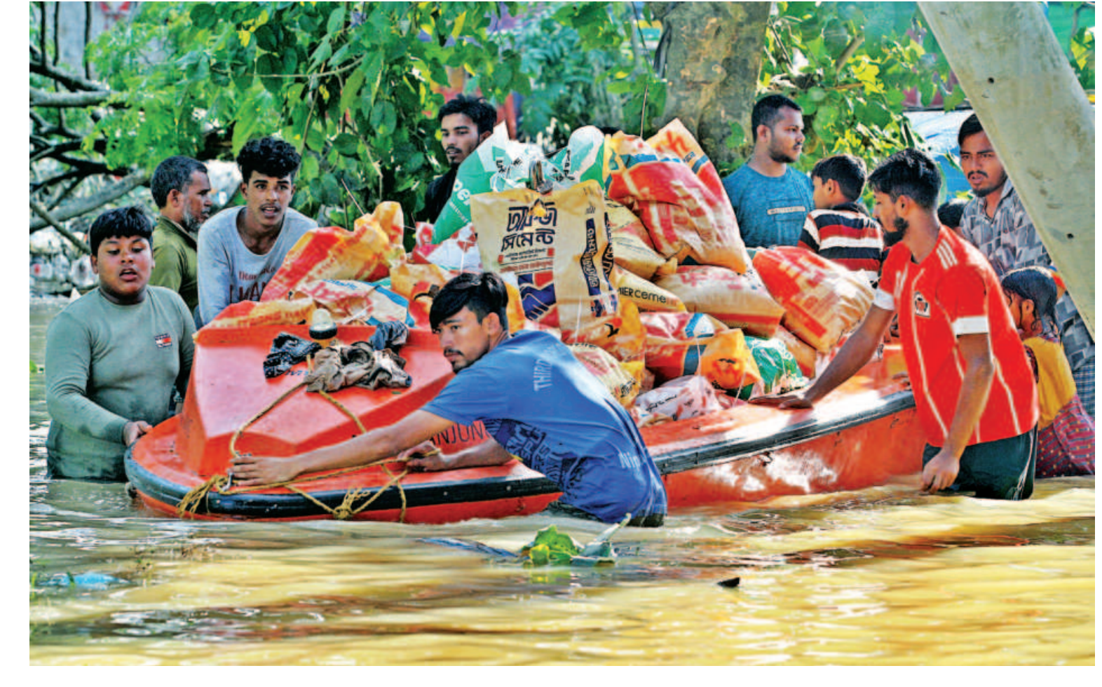
As boats are hard to come by, volunteers pile up supplies on a boat in Dadurpol Kitchen Market area of Feni town yesterday and try to take the vessel to hard-to-reach areas where flood victims need relief materials.

"We are still trying to extinguish the SEE PAGE 7 COL 6