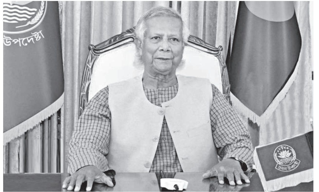
Chief Adviser Dr Muhammad Yunus addressed the nation on August 25, 2024.

Dr Yunus also touched upon certain challenges and urged the people to bear with him and have patience. As for the reforms, he predictably stressed on judiciary, law and order, administration, Election Commission, and the media. But the de facto prime minister also mentioned agriculture, health, and education. He mentioned a police commission and a banking commission. One of the advisers had previously mentioned media commission, but the chief adviser said