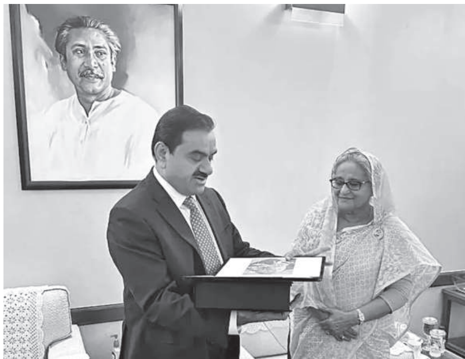
Gautam Adani, founder and chairman of India's Adani Group, meets former Prime Minister Sheikh Hasina at Gono Bhaban on July 15, 2023.

Even though Sheikh Hasina's government allowed India several benefits, including the upcoming railway line that will allow the transport of goods and travel of passengers