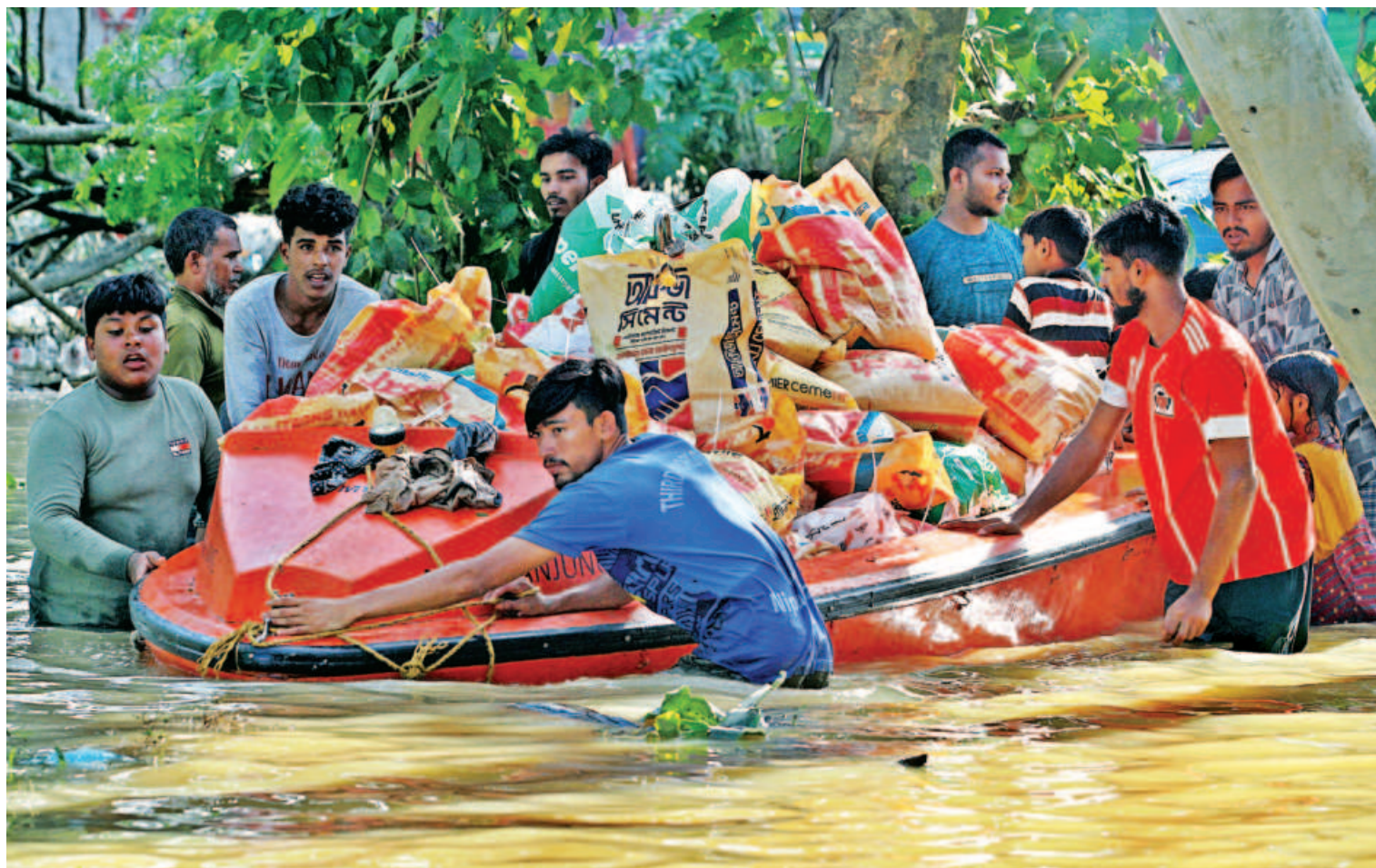
As boats are hard to come by, volunteers pile up supplies on a boat in Dadurpol Kitchen Market area of Feni town yesterday and try to take the vessel to hard-to-reach areas where flood victims need relief materials.