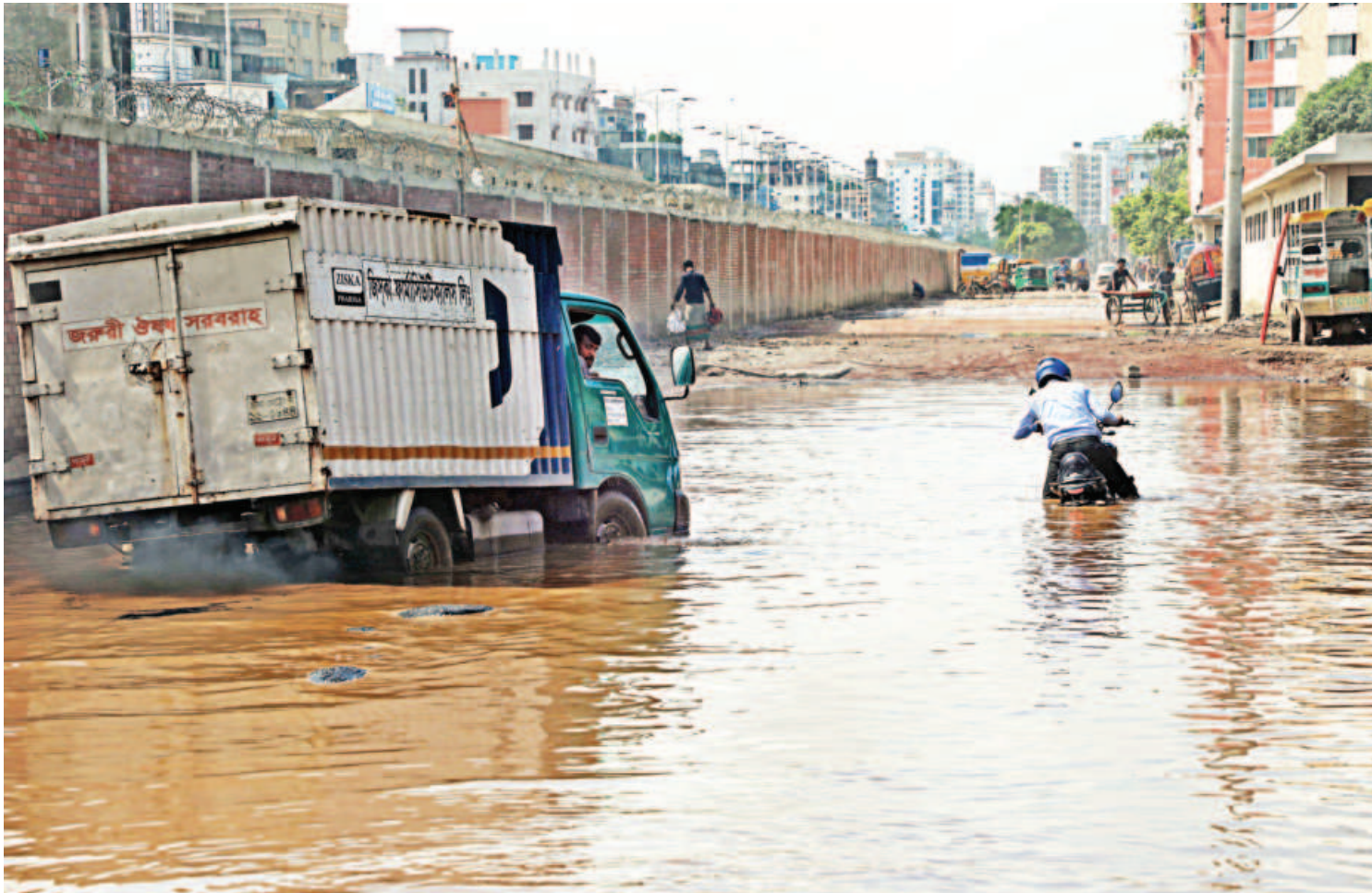
The road beside the Jurain Railway Market in the capital's Jurain area goes under water even after minimal rainfall, causing suffering for commuters and vehicles. With the road's numerous potholes remaining invisible due to the water, it gets risky for vehicles to ply the road amid the situation. The photo was taken yesterday.