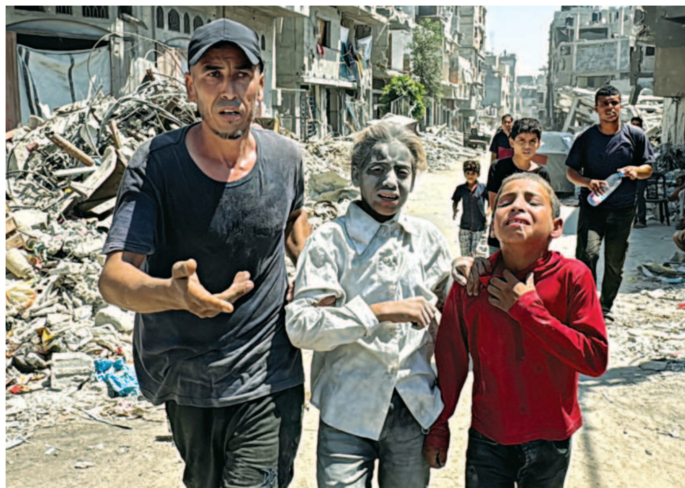
Palestinians evacuate injured children at the site of an Israeli strike that destroyed several houses in Khan Younis in the southern Gaza Strip yesterday.