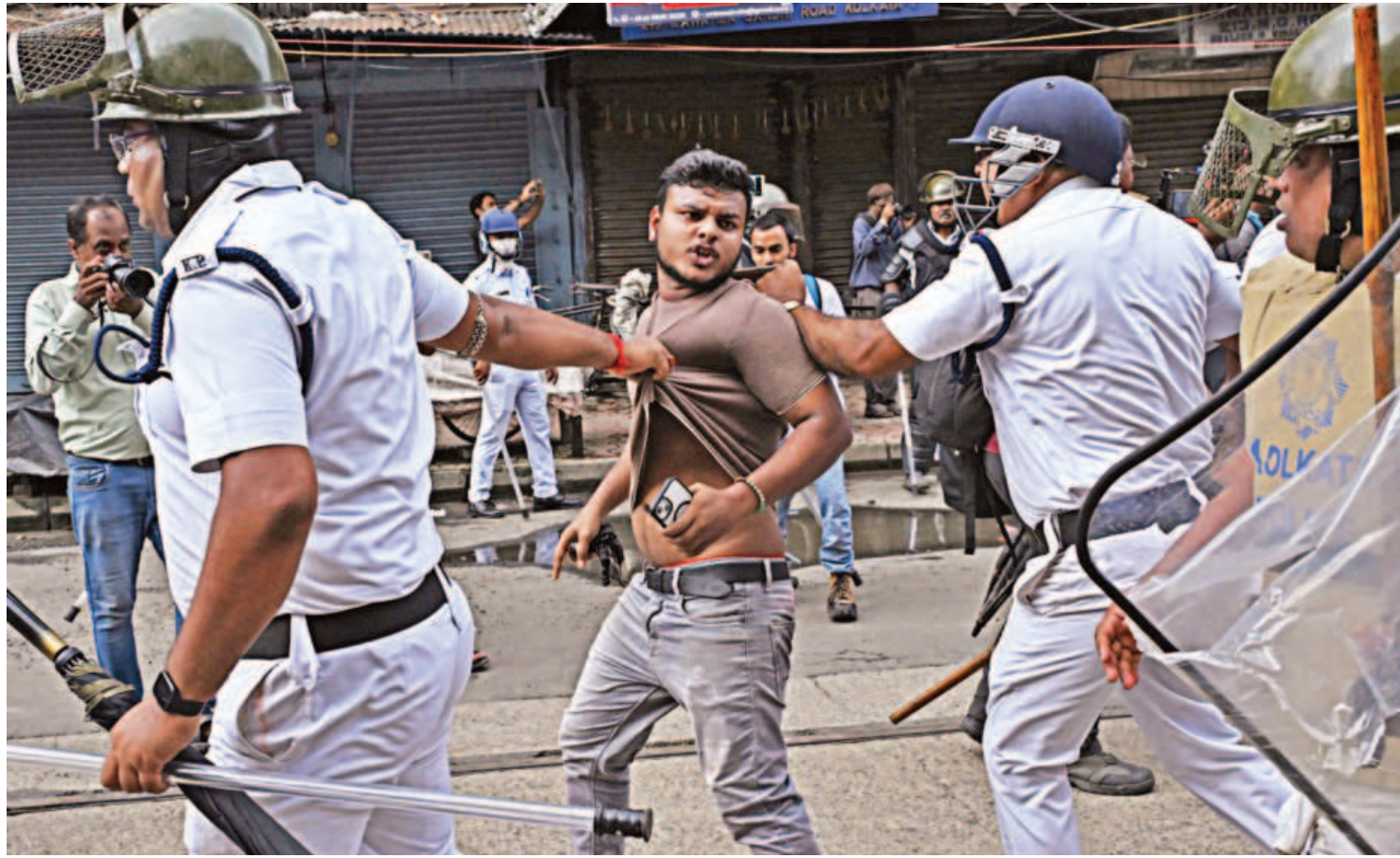
Police detain an activist as they march towards the state secretariat demanding the resignation of Mamata Banerjee, chief minister of India's West Bengal state, in Kolkata yesterday.

Without providing evidence, Vyacheslav Volodin, the chairman of Russia's State Duma, the lower house of parliament, earlier said the United States, through France, was attempting to exert control over Telegram.