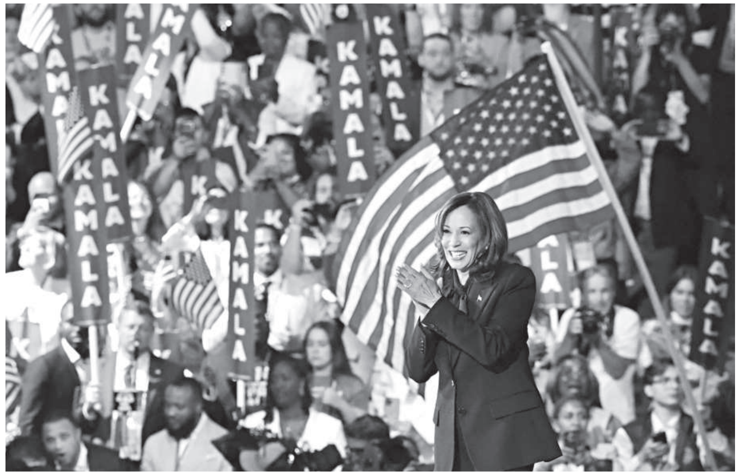
Democratic presidential nominee and US Vice-President Kamala Harris applauds from the stage on Day 4 of the Democratic National Convention (DNC) at the United Center in Chicago, Illinois, US on August 22, 2024.

As of August 26, Harris maintains a tight lead of 2.5 percent in Michigan polls over Trump, and in Pennsylvania, the second largest home for Arab Americans, she maintains a 1.1 percent lead based on 29 polls. These polls don't include Jill Stein, who could take up the percentage of the leads that Harris has over Trump. Another fact to note: polls are polls. They can never be blindly trusted