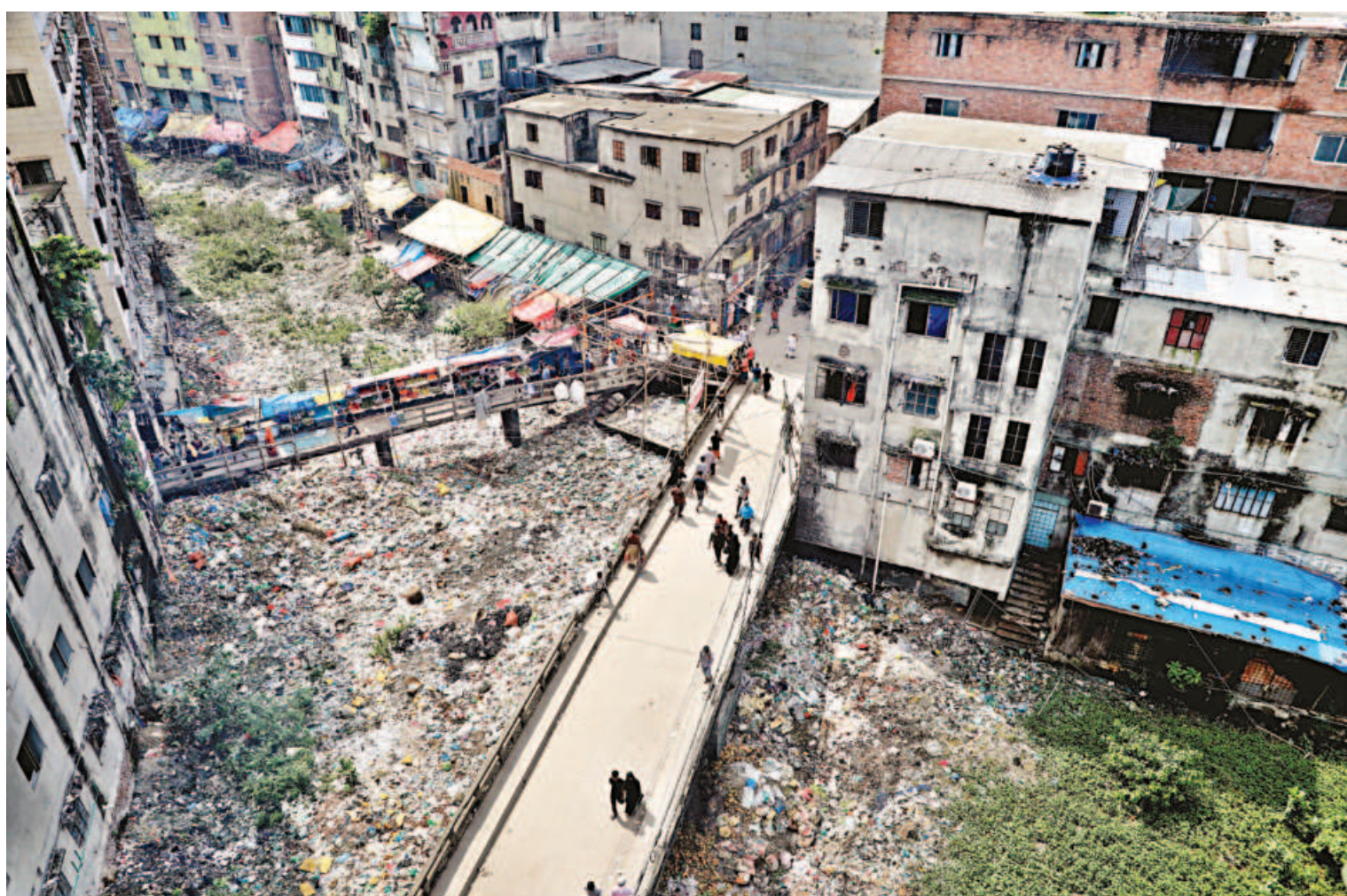
Sweatshops and traders of kitchen markets have turned the Shuvadya canal into a landfill, leaving no room for water to flow. The photo was taken in Dakshin Keraniganj a couple of days ago.