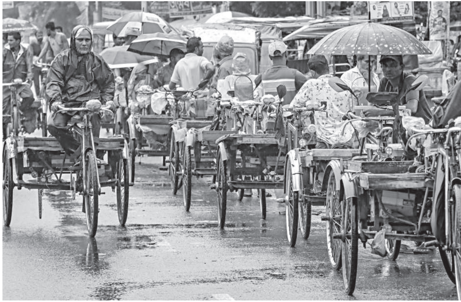
Amid incessant rain, pullers of rickshaw vans keep waiting for work while parking their vehicles on the side of the road. As there are very few people getting outside due to the downpour, they have been struggling to find passengers or other work. The photo was taken in the Boyra Bazar area of Khulna city recently.