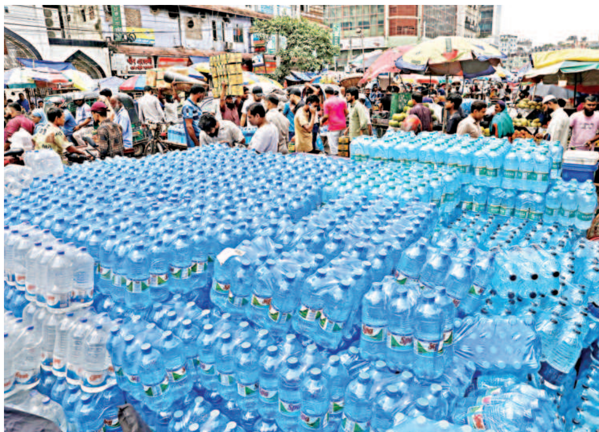
Bottled water in large stocks on sale in the capital's Karwan Bazar yesterday amid the high demand for clean drinking water during the ongoing floods.

The lawyer requested the notice recipients to explain under which process those convicted persons' sentences have been commuted or suspended.