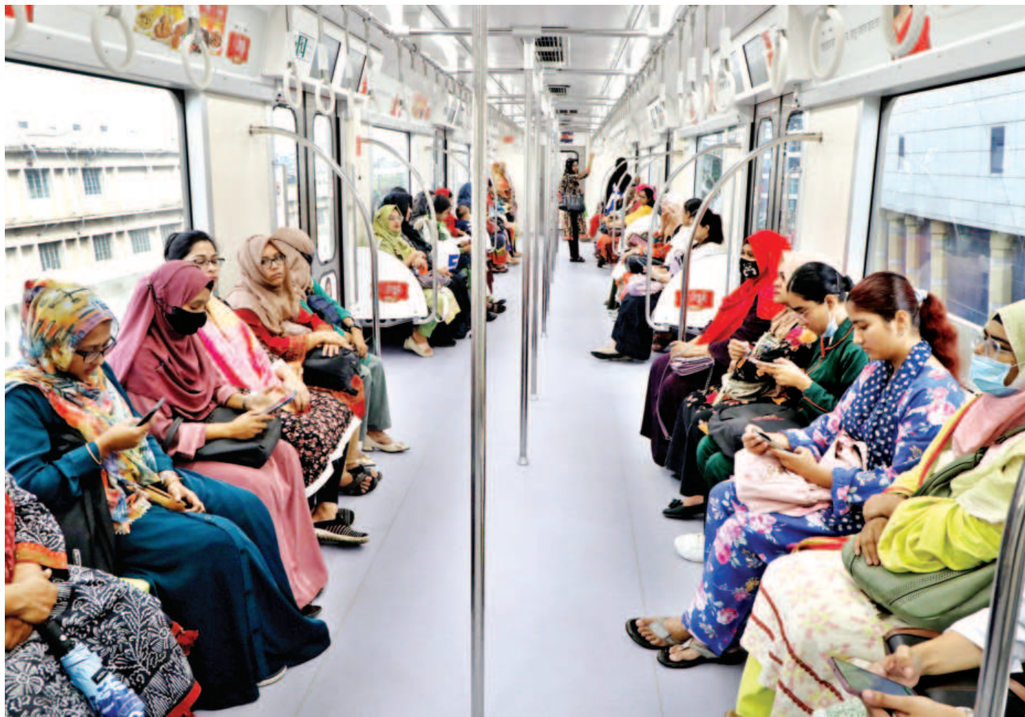
Women passengers travel in their designated compartment on the metro rail, as its operations yesterday after over a month of suspension. Despite the closure of two key stations, metro rail services are back on track, which were suspended on July 18 amid violence centring the quota reform protests.