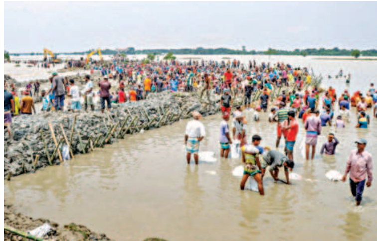
Thousands of villagers, including around a thousand women, work tirelessly to repair a breached embankment near Kalinagar village. The embankment was breached four days ago, completely submerging thirteen villages. The locals have blamed the BWDB for using substandard materials during repair works.

The locals have blamed the Bangladesh Water Development Board for using substandard