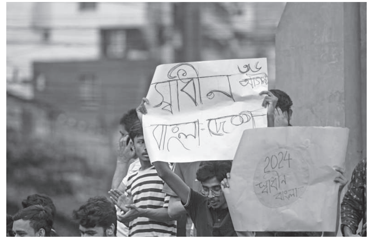
We now have the opportunity to correct the wrongs that were done over the past 15 years.

Can we rightfully claim the land to be ours when emissaries from a