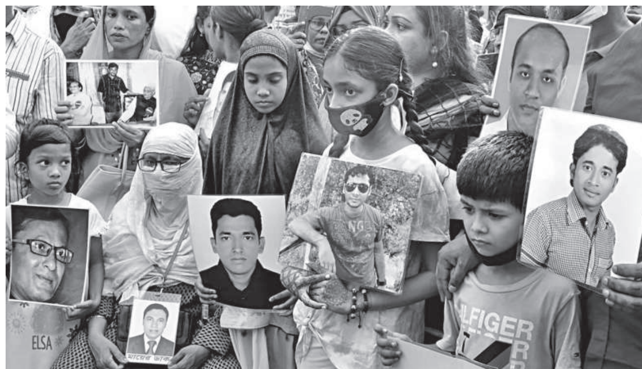
Children of the victims of enforced disappearances hold their photos at a rally in front of the National Museum in Dhaka, May 28, 2022.

I believe the student revolution was an outburst against the wrongs done to the people and the country. We now have the opportunity to correct those wrongs. Failure is not an option.