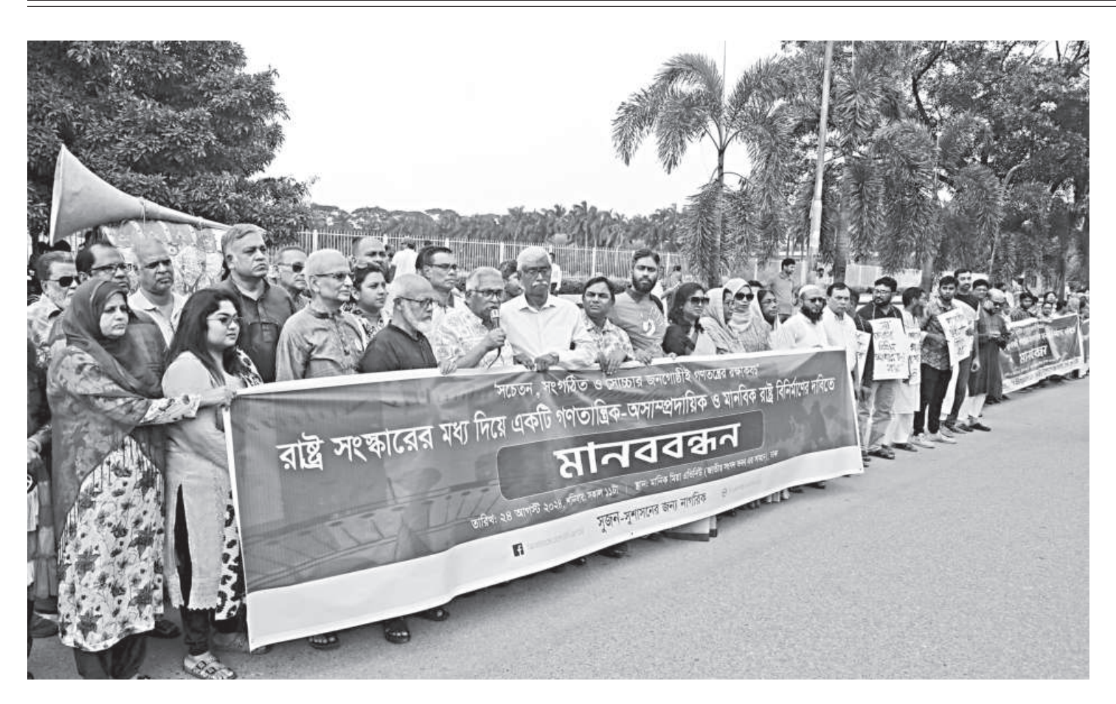
A human chain was formed by Shujan demanding reforms to the state to make the country more democratic, secular and humanitarian. The photo was taken on Manik Mia avenue in front of the parliament building yesterday.