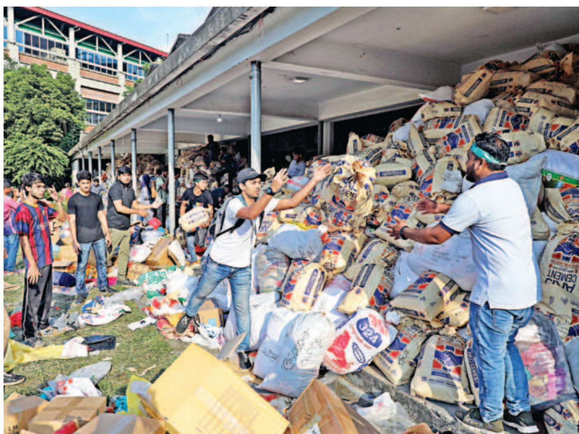
Student volunteers stocking, sorting and packaging relief materials inside TSC complex of DU for the third day in a row, to be sent to flood affected victims across the country. The photo was taken yesterday.