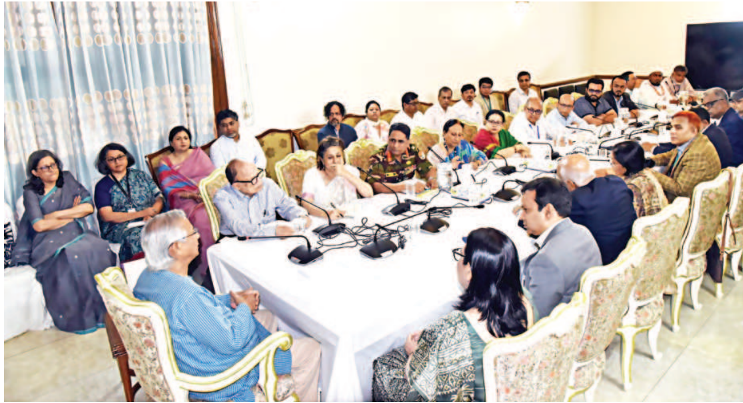
Chief Adviser to the interim government Dr Muhammad Yunus meets leaders from various NGOs to discuss the recent flood situation in the country. The meeting took place at the state guest house Jamuna yesterday.