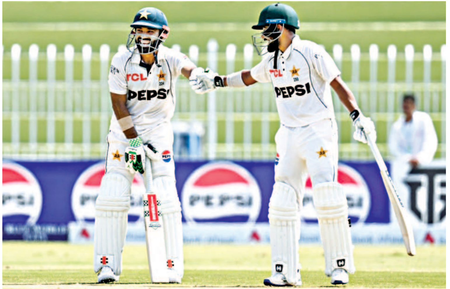
Pakistan's Mohammad Rizwan and Saud Shakeel pump fists during their 240-run fifth-wicket partnership, which helped the hosts post a formidable total of 448 for six before declaring the first innings against Bangladesh in the first Test at the Rawalpindi Cricket Stadium yesterday. Bangladesh, in reply, were 27 for no loss at the end of second day's play. Story on Page 11.