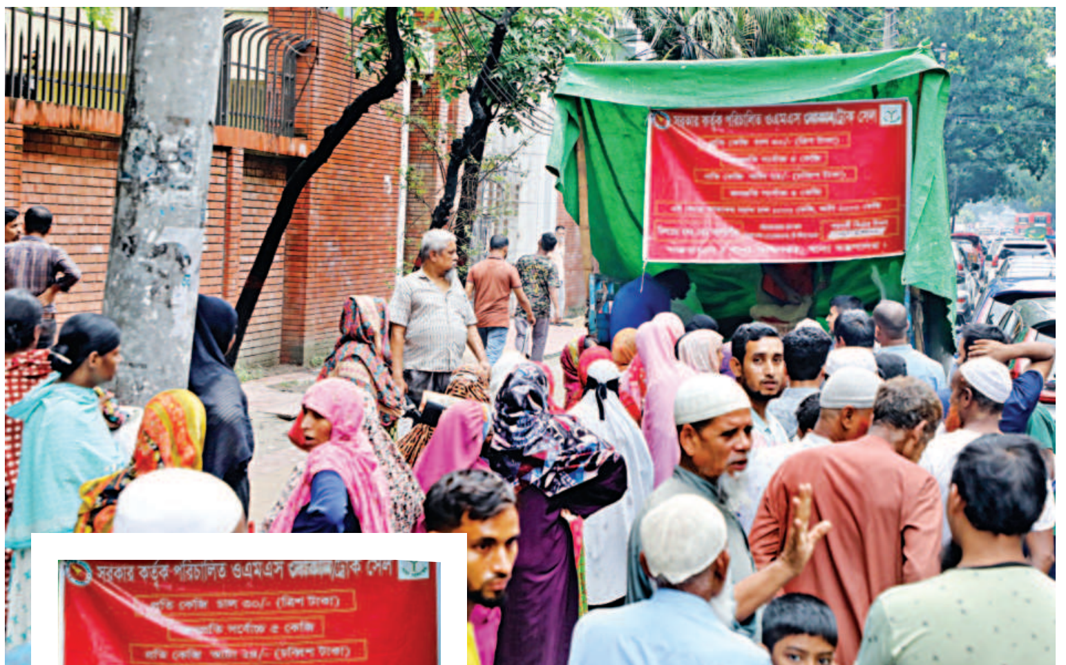
Amid ongoing inflation, a large crowd gathers in front of this open market sale to purchase essential commodities at reduced prices. Each person is allowed to buy only five kilogrammes of rice and flour each at a time. The photo was taken on the Abdul Gani road in the capital yesterday.