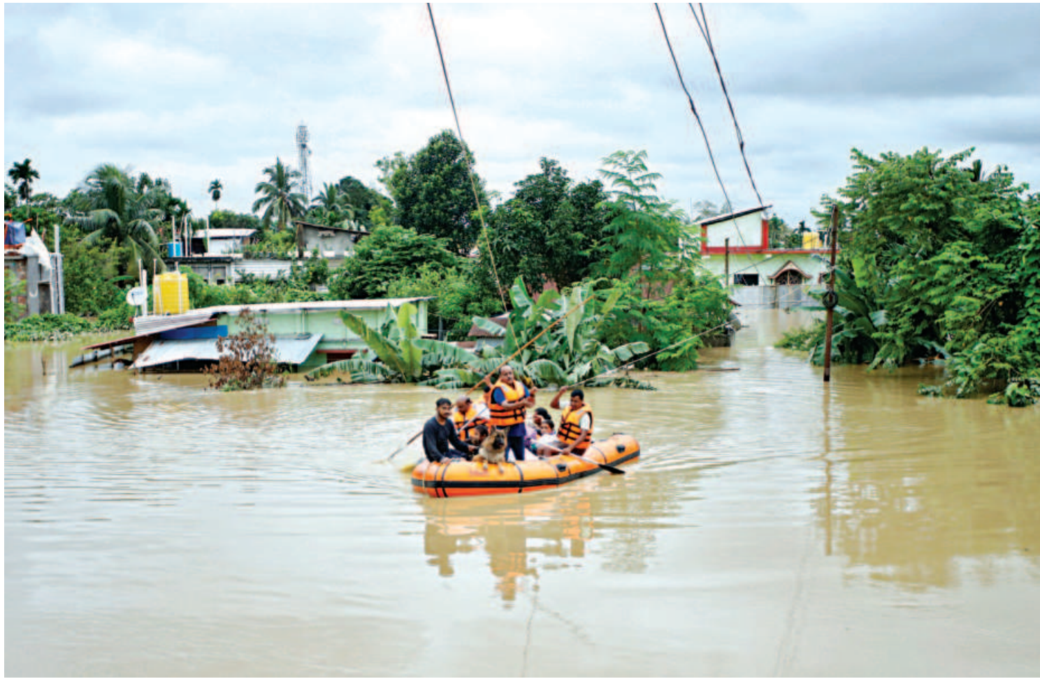
Rescuers from Tripura Disaster Management Authority evacuate flood-affected people to a safer place following heavy rains at a village on the outskirts of Agartala, India yesterday. At least 10 people were killed after heavy rainfall in Agartala led to floods due to overflowing Gomati River, with over 34,000 persons being displaced, officials said.

The white coat wearing personnel of the Ministry for the Propagation of Virtue and the Prevention of Vice in charge of enforcing the law have been fixtures of Afghan streets since the Taliban swept to power in 2021.