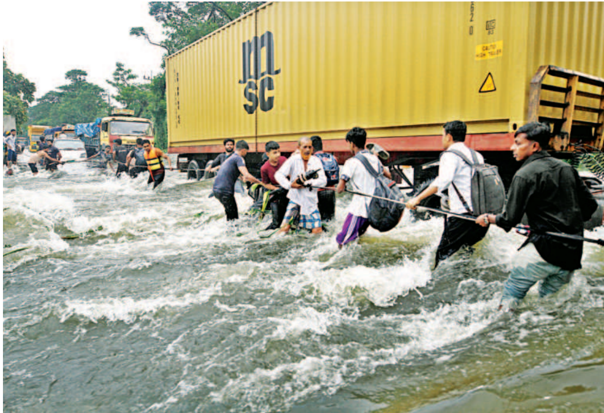
Pedestrians use a rope to stay on course as floodwater rushes across the Dhaka-Chattogram highway in Feni's Lalpool area yesterday. Vehicles heading for Chattogram are seen crawling their way through.