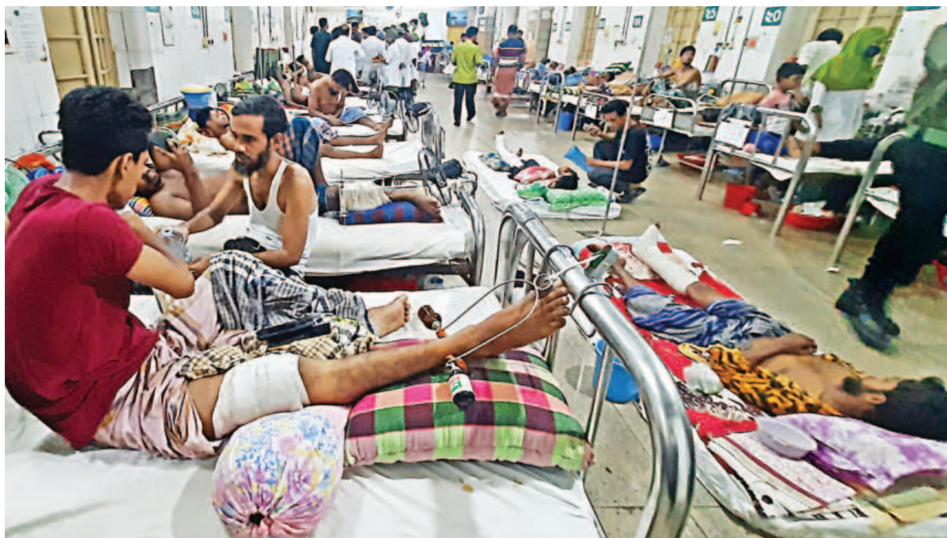
Over 500 patients, all of whom were injured during the recent mass uprising, are currently receiving treatment in government and private hospitals according to DGHS. Some are students, others blue-collar workers many of whom have lost their eyesight and even their limbs. The photo was taken at DMCH recently.