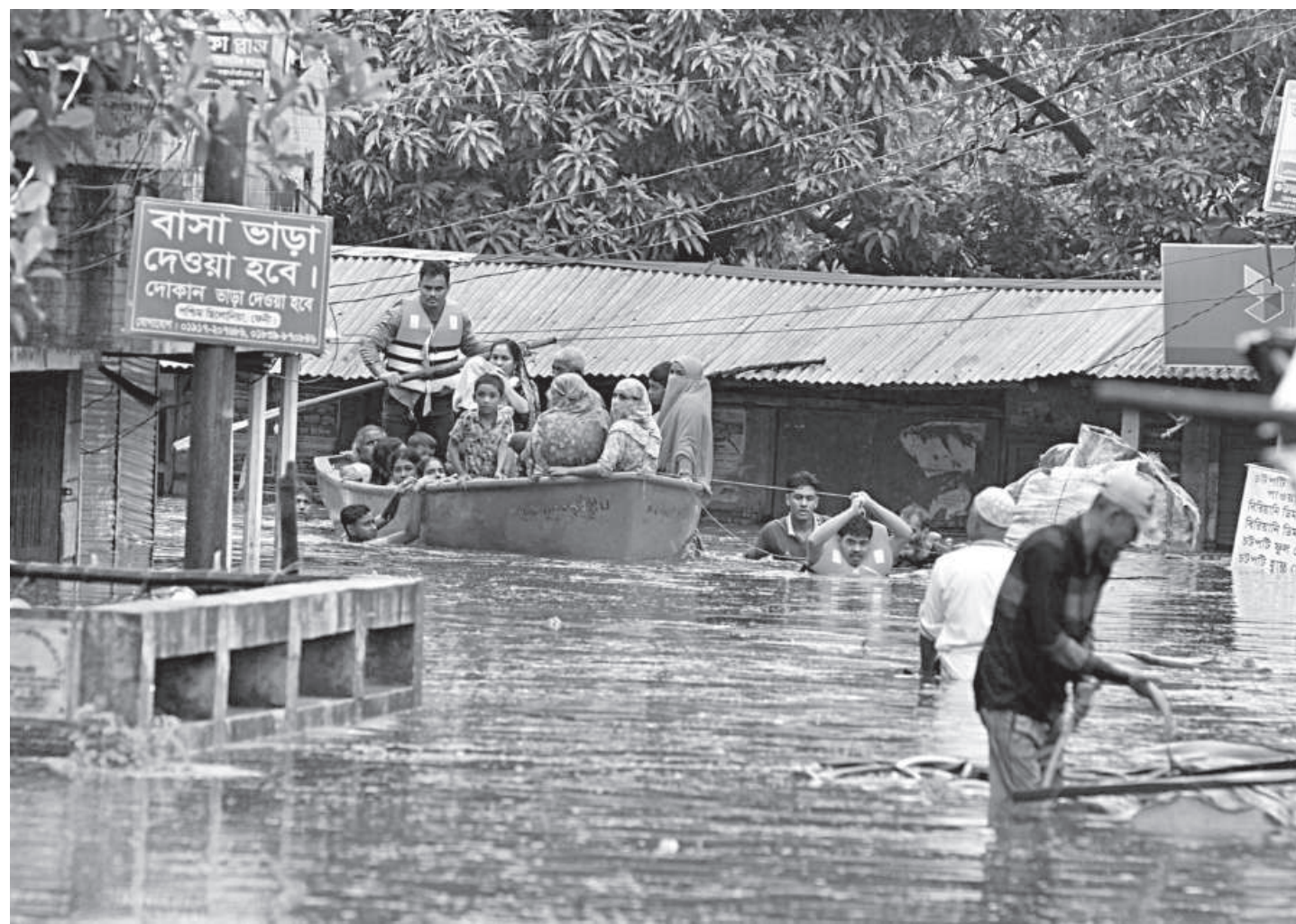
Feni locals are not used to such terrible flash floods, neither are government and non-government authorities.

There is enough relief to provide immediate support, as per government data. But the real issue, as I said before, is accessing the affected people. One of the demands coming out of the flood-affected areas has been to use helicopters to rescue those who are marooned, but we are not able to do so because the weather is still quite treacherous, so helicopters still cannot reach those areas. There is also a demand that helicopters be used to provide relief; even that is not possible at the moment because 1) there is too much water, and 2) when you drop relief from a helicopter, people rush towards it and there