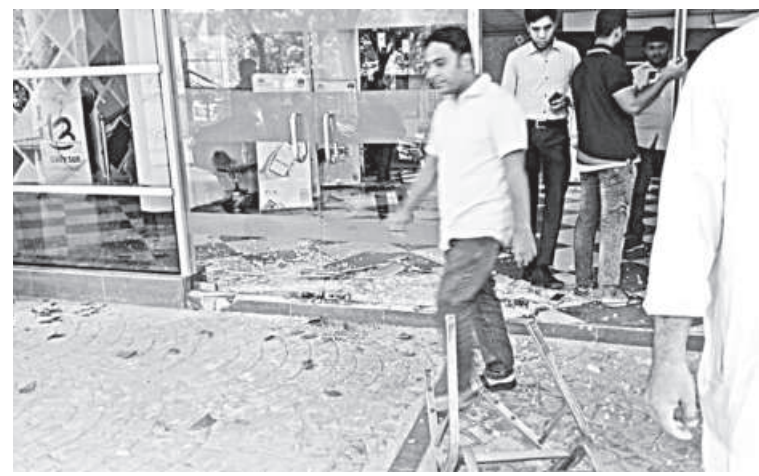
The East West Media Group's office in Bashundhara Residential Area, Dhaka was attacked on August 19, 2024.

Vandalising media establishments, TV stations—the latest incident occurring at the East West Media Group—deserve our condemnation. The policies of these establishments may have been unethical, one-sided and devoted to serving the fallen government, but their voices still cannot be forcibly shut. However