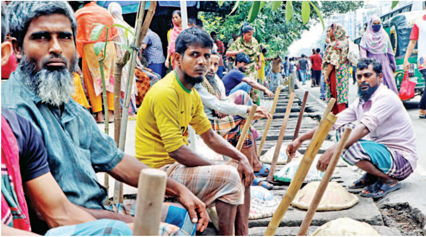
Construction workers, who work on hire on a day-to-day basis, pass idle times in Natun Bazar area in the capital. They say work has become scarce since the recent unrest leading to the resignation of the Sheikh Hasina-led government. On a normal day they can earn anywhere from Tk 650 to Tk 700. The photo was taken last Tuesday.

Bangladesh saw gold prices rise above Tk 100,000 per bhoari for the first time on July 20 last year.