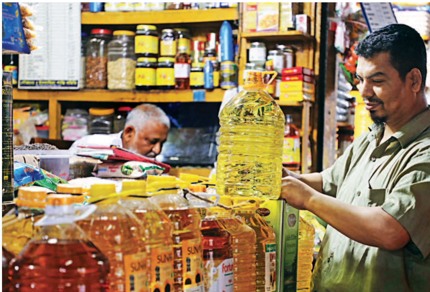
The growing middle-income consumer segment is driving demand for edible oil in Bangladesh, with global analysts and industry experts saying that the country will become a major export destination in the years to come.

The Financial Times first reported on Thursday that PwC China expected a six-month business ban by Chinese authorities as early as September.