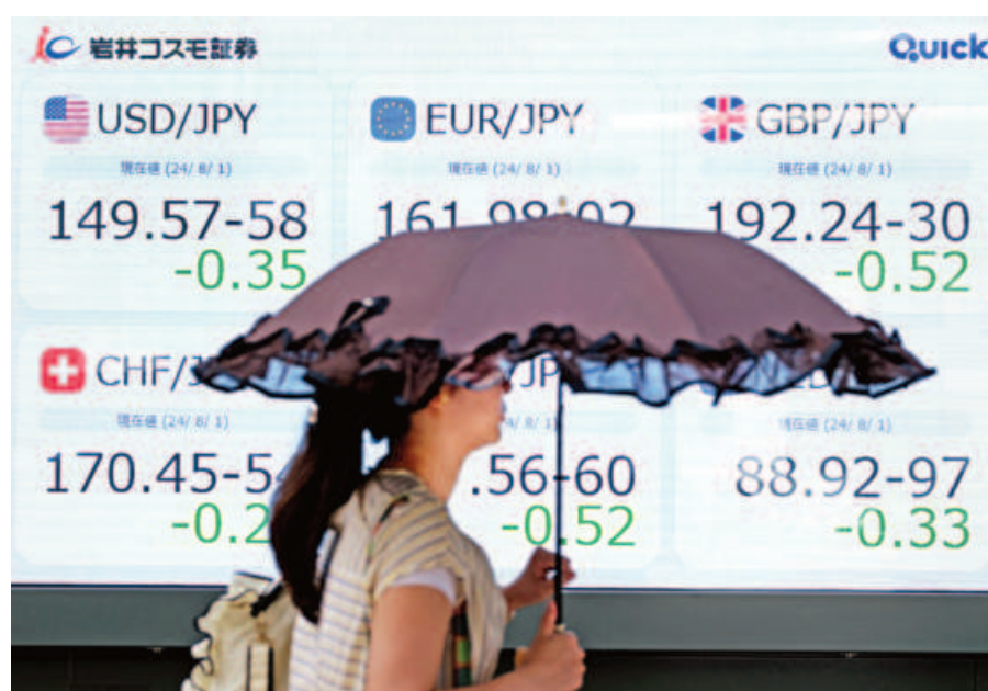
A woman walks in front of an electronic board displaying the exchange rates for various currencies, including the US dollar, in Tokyo on August 1.

July US existing home sales numbers are also due out.