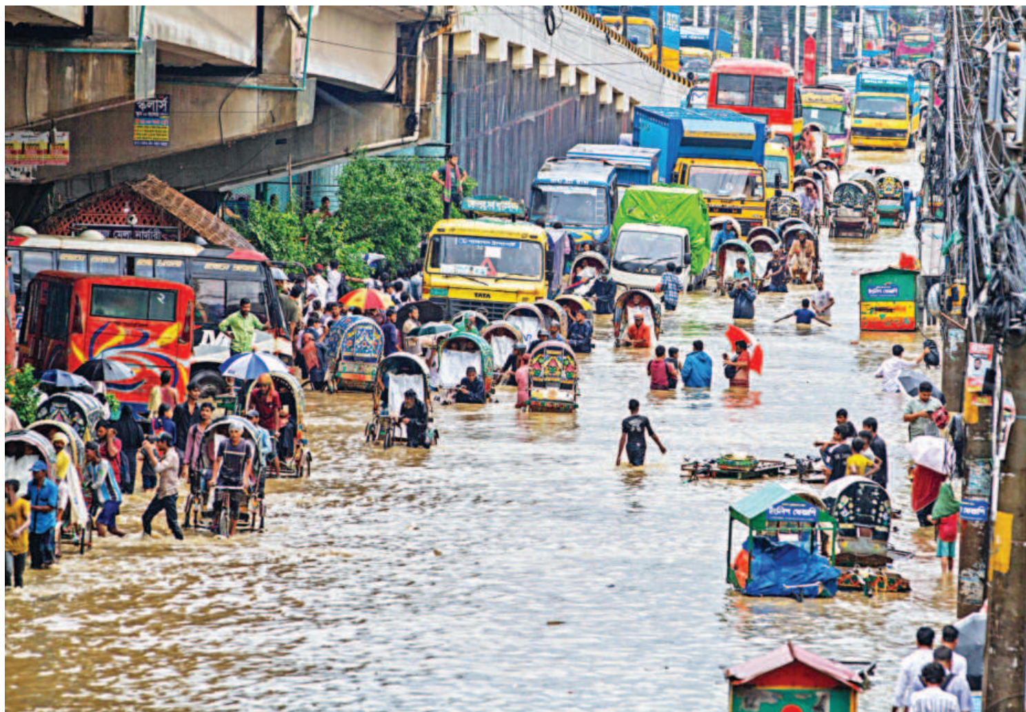
Due to the nonstop rain since early morning, the port city's low-lying areas were submerged under ankle- to waist-deep waters yesterday, causing immense suffering to residents. The active monsoon is expected to bring more rain in the next few days. The photo was taken in Chattogram city's Muradpur area.