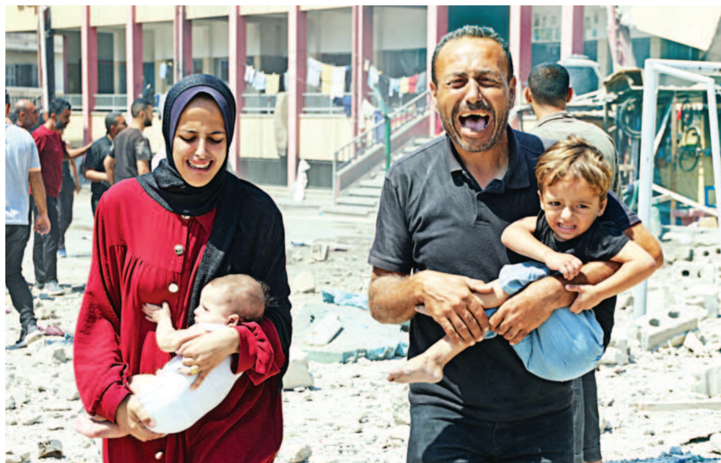
Palestinians carry their children as they flee after an Israeli strike on a school, housing displaced Palestinians, in the Rimal neighbourhood of central Gaza City yesterday.