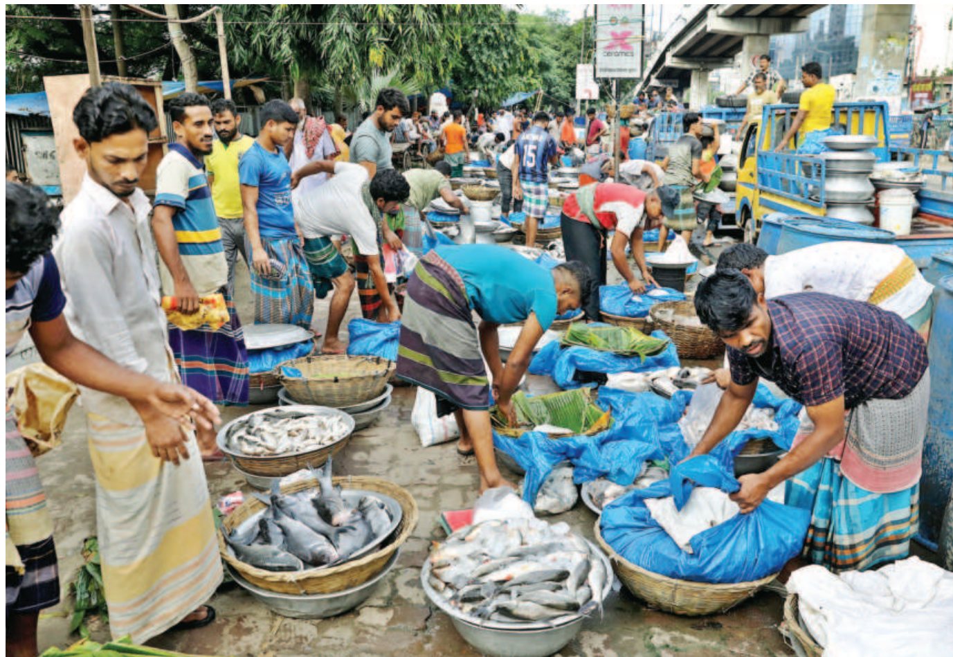
While the Karwan Bazar wholesale fish market is overflowing with various types of fish, including hilsa, prices have not dropped at the local markets as one would expect. The photo was taken yesterday around 7:00am.

Scientists say the discovery should help solve long arguments about the history of the Earth, as well as the objects that have collided with it from elsewhere in space.