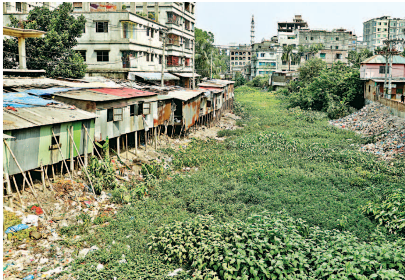
Traders have set up tin-roofed shops encroaching upon the Shubhadya canal in Keraniganj's Purbapara area. The canal has become clogged with waste and construction debris. The photo was taken recently.