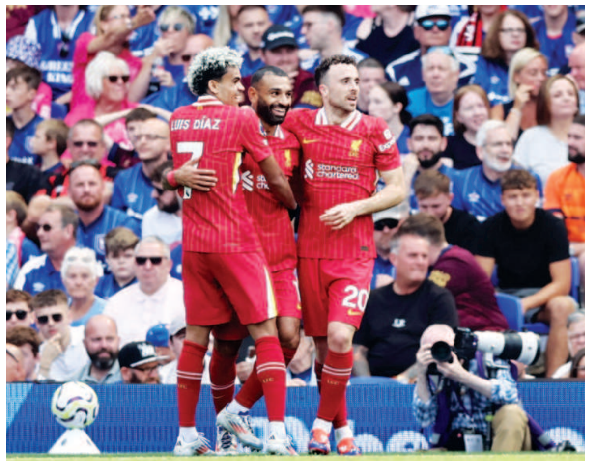
Liverpool's Mohamed Salah (c) celebrates scoring their second goal with Luis Diaz and Diogo Jota, who netted the opener, during their 2-0 win over newly promoted Ipswich Town in a Premier League fixture at Portman Road yesterday, marking a strong start to their season in the post-Juergen Klopp era under the leadership of Arne Slot.

Bobb could miss up to four months after breaking his leg in training while Rodri is still recovering from an injury sustained at Euro 2024.