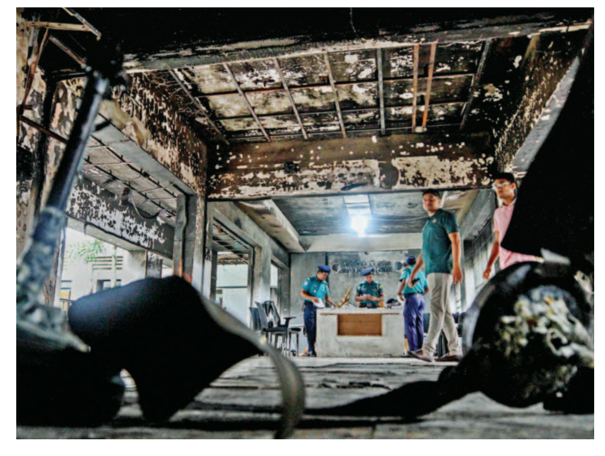
Policemen working in a charred room of Chattogram city's Kotwali Police Station yesterday. Hours after the ouster of the Awami League government on August 5, a mob attacked and torched the police station, causing extensive damage. The station resumed partial operations on August 10.