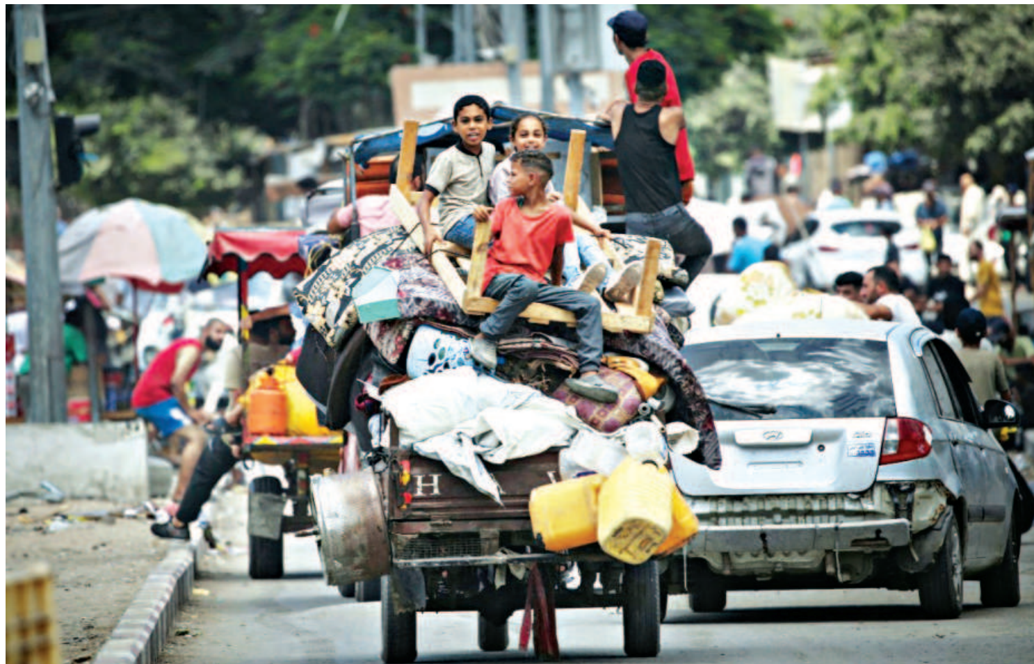
Palestinians flee with their belongings from Deir el-Balah in the central Gaza Strip to a safer place yesterday after Israel issued a new evacuation order.