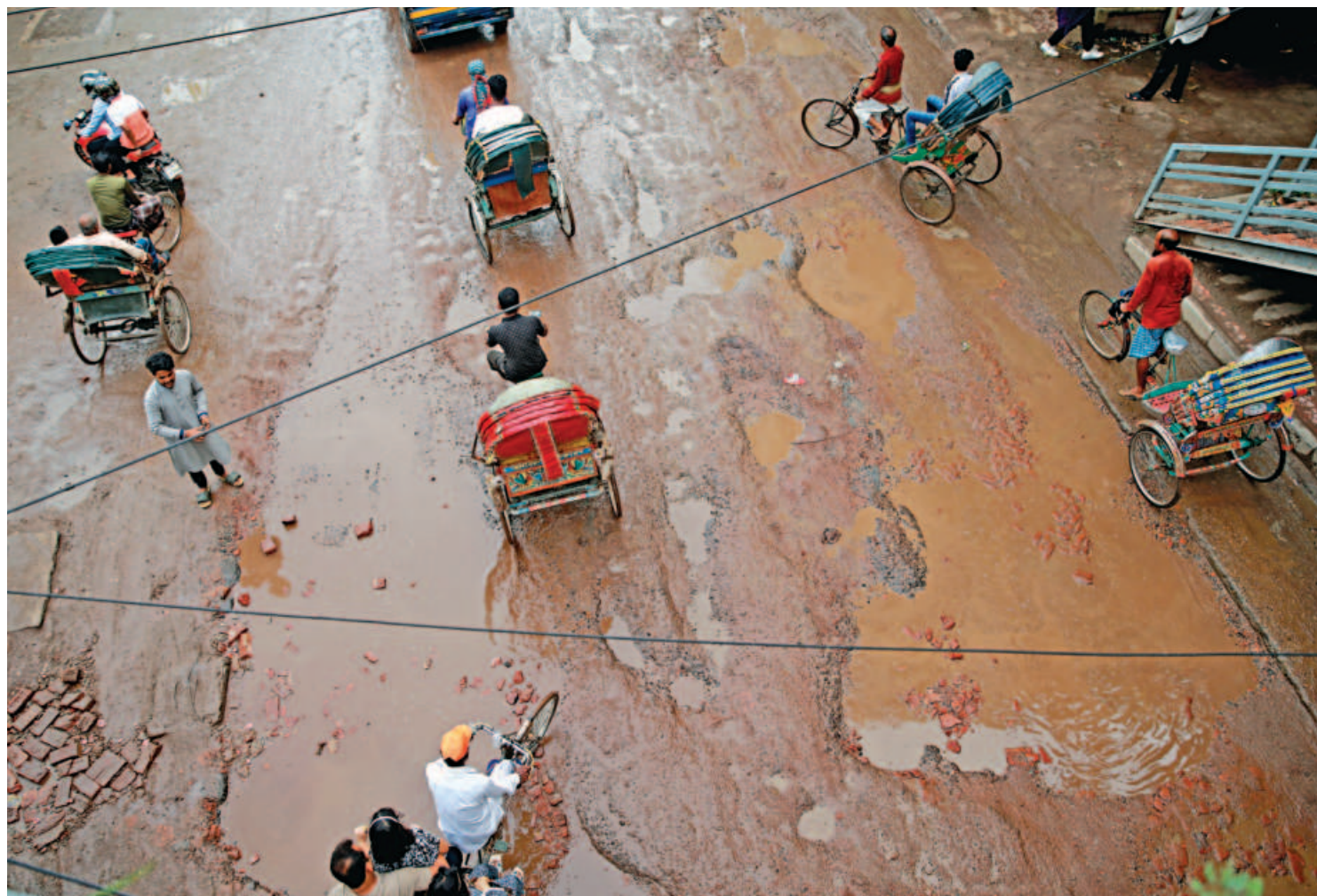
A portion of Hatkhola road in Old Dhaka's Tikatuli is in a bad state. Underground utility lines were installed around three months ago, but the road was not restored properly, causing problems for the users. The photo was taken yesterday.