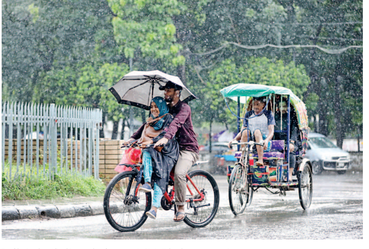
Two friends enjoy a bike ride on a rainy afternoon on the Dhaka University campus yesterday.

"We have fought a long battle... If you SEE PAGE 4 COL 8