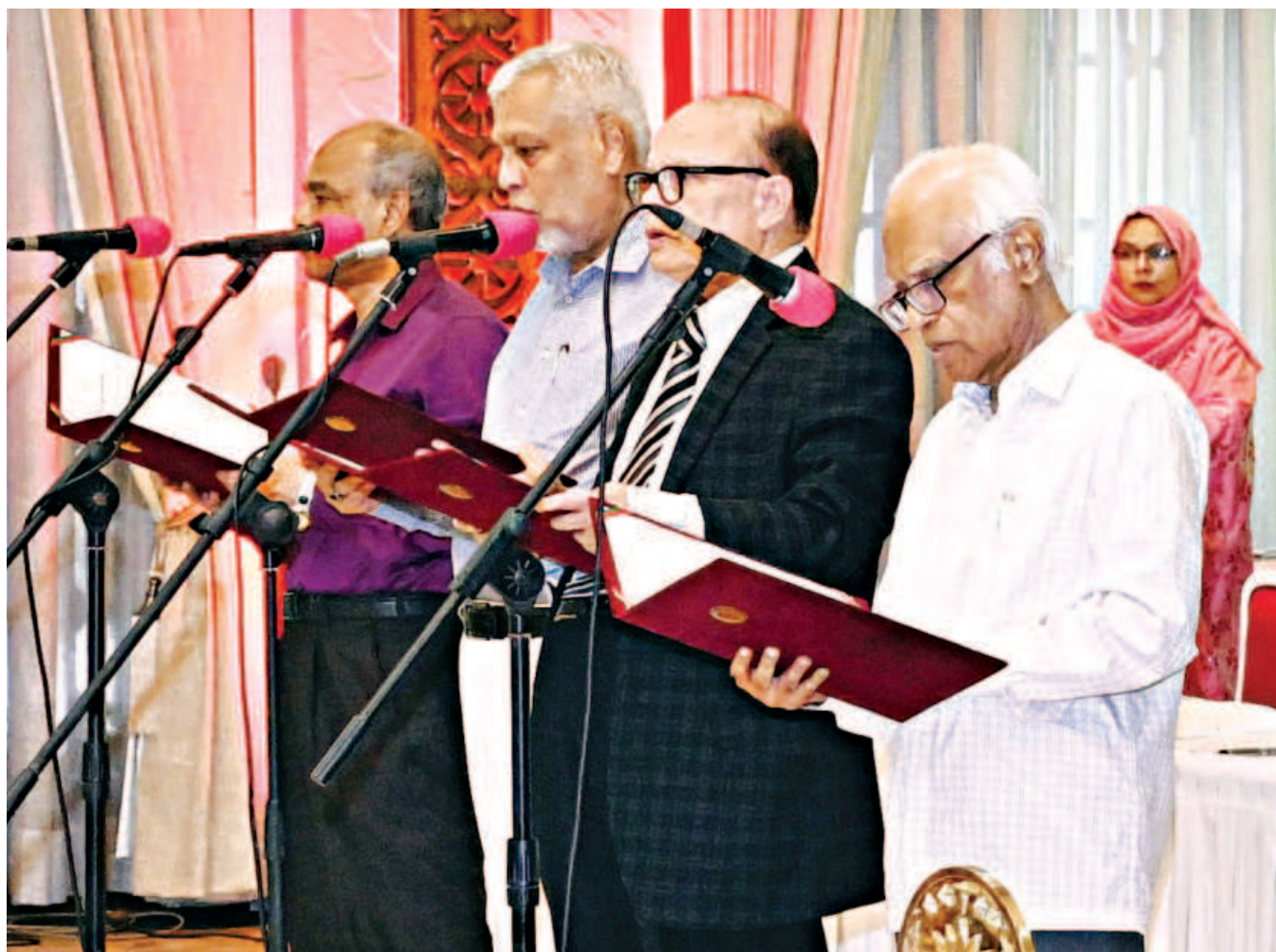
Four new advisers to the interim government take oath of office at the Bangabhaban's Darbar Hall yesterday. President Mohammed Shahabuddin, not in picture, administered the oath.