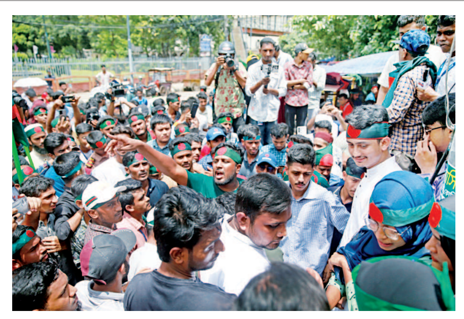
Students under the banner of Anti-Discrimination Student Movement hold a rally in front of National Museum in Shahbagh yesterday as part of their "Resistance Week" programme.

Passengers expressed satisfaction at the full restoration of train services after the long hiatus. The Bangladesh Railway suspended operations of passenger trains on July 19 amid the violence centring the quota reform movement. Although operations of passenger trains resumed on a limited scale on August 1, the authorities on August 3 suspended it for August 4 and later halted the operations of all kinds of trains until further notice.