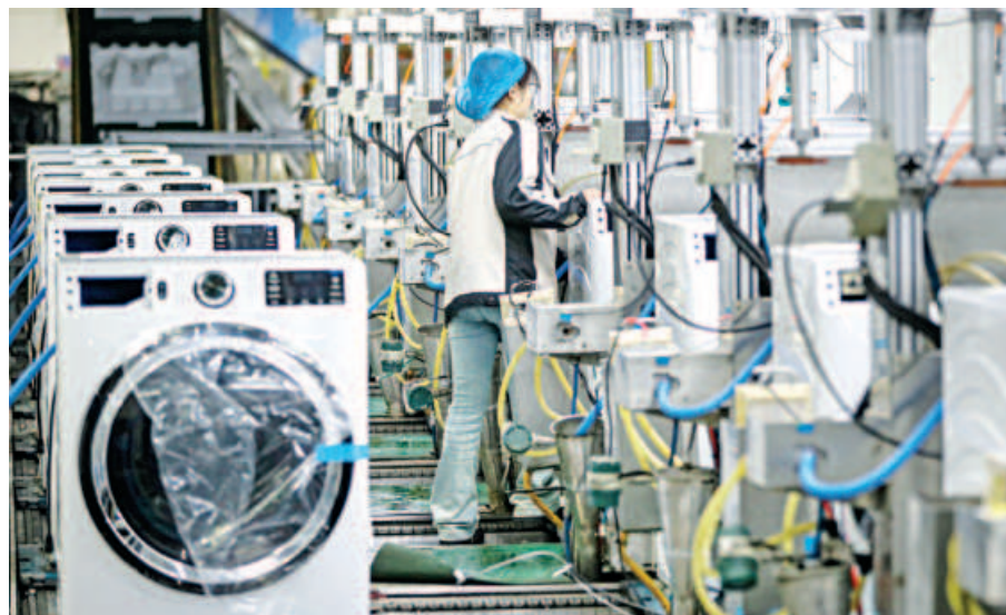
An employee works on a washing machine production line at a factory for Chinese company Haier in Qingdao, in eastern China's Shandong province. China's industrial production growth weakened in July, with the month's 5.1 percent expansion inching down from 5.3 percent in June.

This sector has been under pressure with many housing developers on the brink of bankruptcy, discouraging Chinese from investing in property.