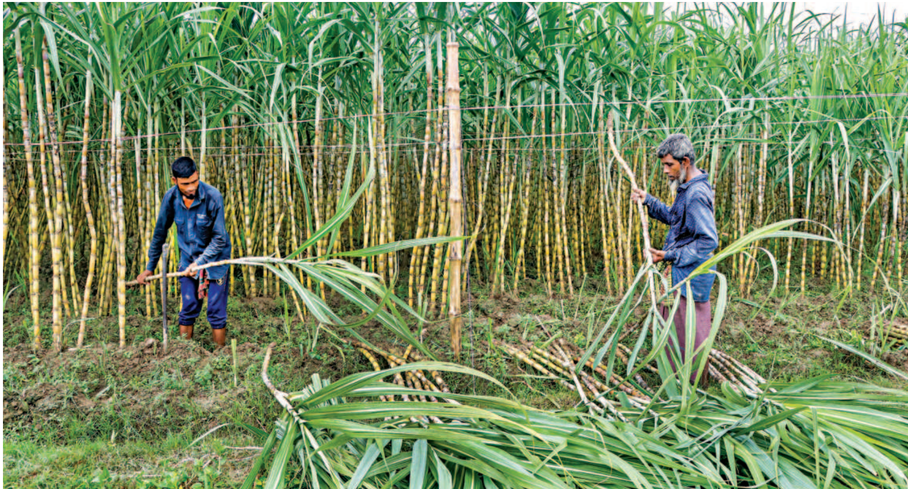
Farmers harvest sugarcane in Kedarpur village of Jashore's Keshabpur upazila. Primarily cultivated for its juice from which sugar can be processed, this perennial grass takes around a year to mature. Each sugarcane is selling around the district for around Tk 15 to Tk 20 at wholesale. The photo was taken recently.