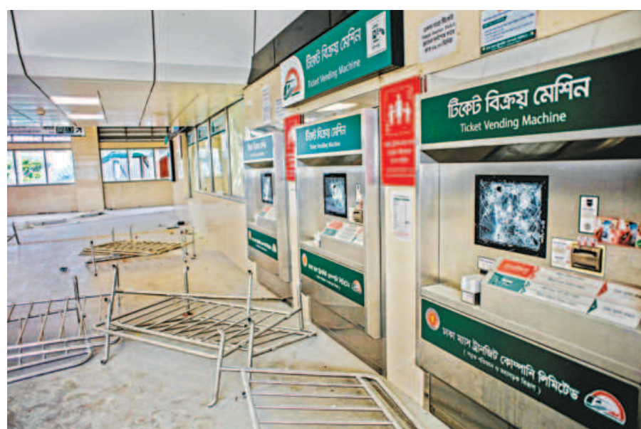
The ticket vending area at the station of Dhaka Metro Rail in the capital's Mirpur-10 was vandalised during the countrywide unrest on July 19.

An official of the Dhaka Mass Transit Company Limited, which operates the metro rail, said the cost of repairs should not exceed Tk 50 crore.