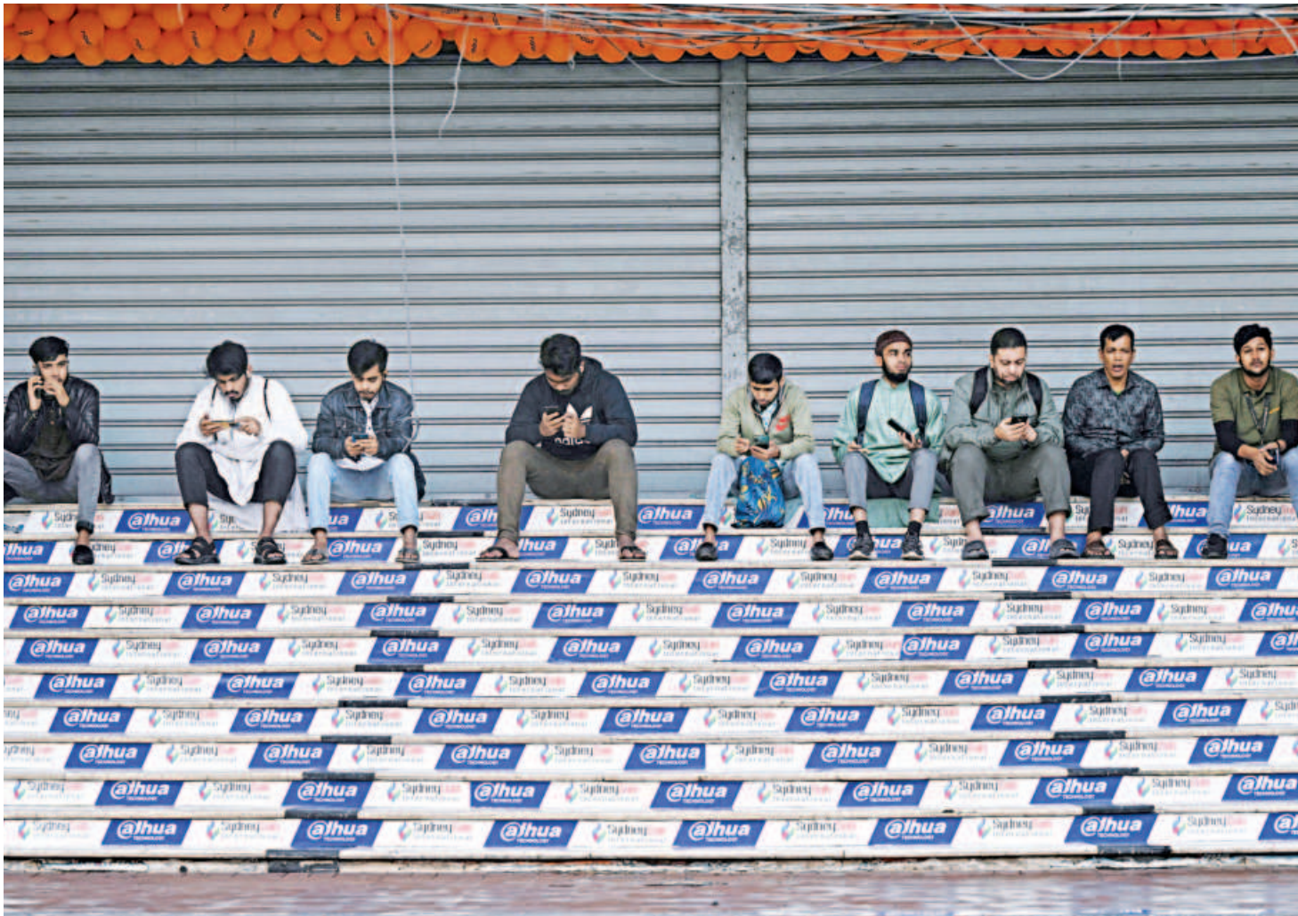
People use their mobile phones while sitting outside closed shops in Dhaka. Sufficient spectrum is essential for ensuring better mobile network performance as it determines the capacity, speed and coverage operators can provide.

China's factory output growth slowed in July while refinery output fell for a fourth month, underscoring the country's spotty economic recovery, also limiting the market's upside.