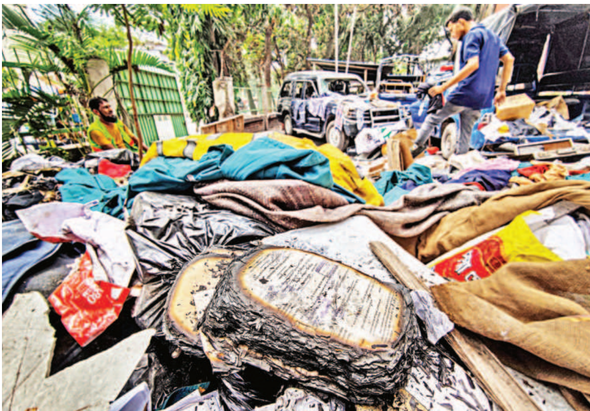
Staffers cleaning up the premises of Mohammadpur Police Station in the capital yesterday, following a mob attack just over a week ago. The attack caused extensive damage to the police station that resumed partial operations on Tuesday.