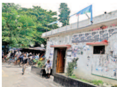
Ward-10 councillor office in Motijheel.

Two Dhaka mayors, most councillors absent from office