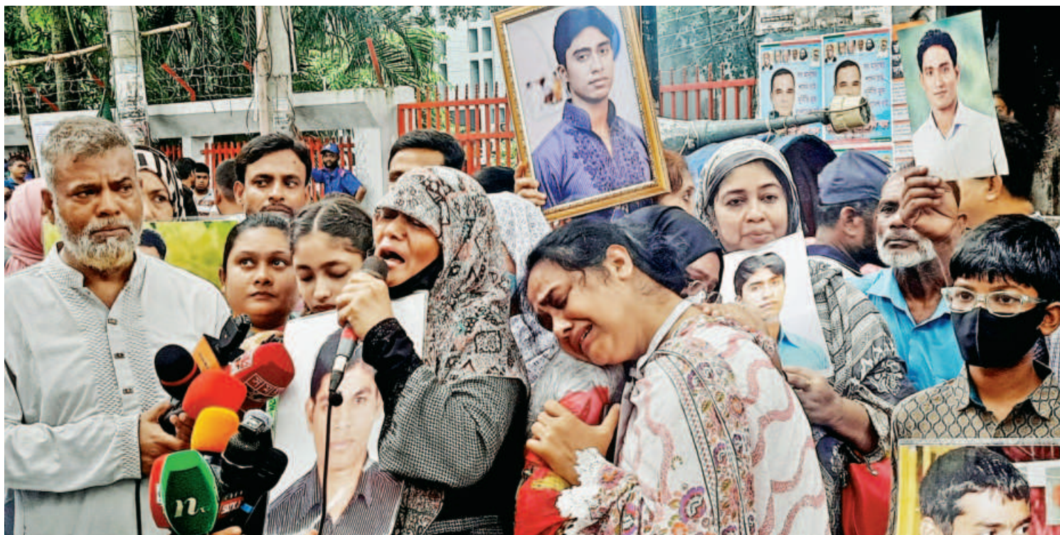
Family members of the victims of enforced disappearance break down in tears at a human chain in front of the Jatiya Press Club in the capital yesterday. “Mayer Dak”, a platform of the victim families, organised the event demanding arrest of the law enforcers involved in forcibly disappearing people.