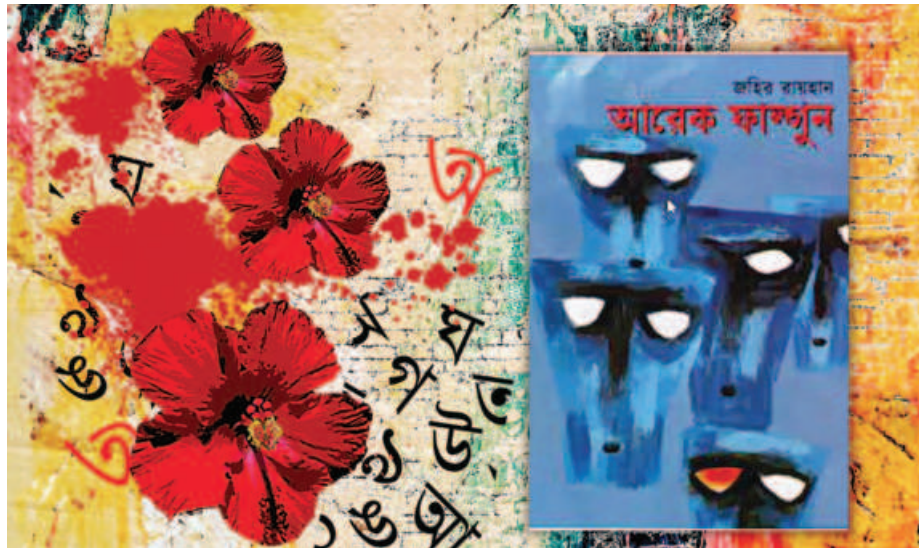
ILLUSTRATION: MAISHA SYEDA

While Kiyo Khan plays the significant role of an antagonist, it's Bazle Karim who