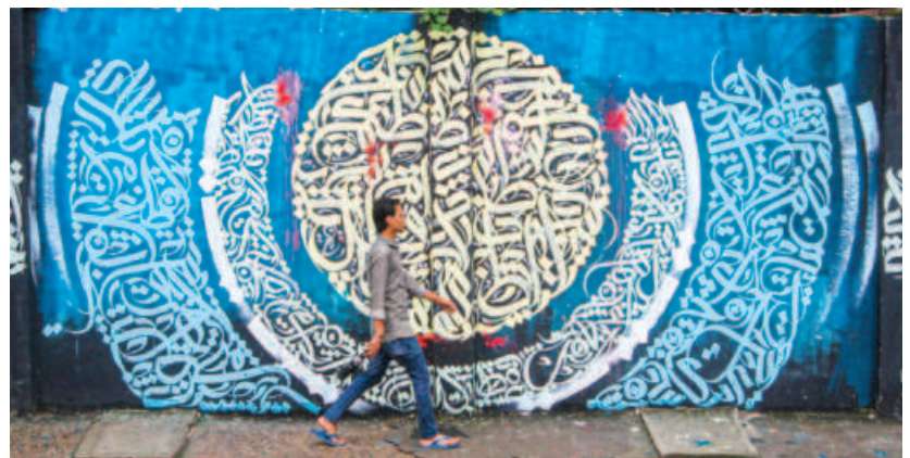
GEC, Chattogram