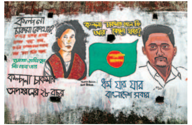
Chawkbazar, Chattogram