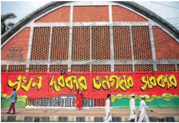
Dhaka University (DU)